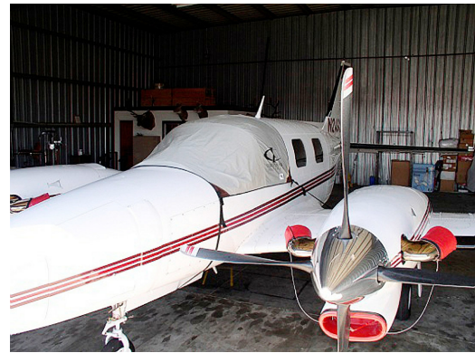
Piper Cheyenne Cockpit Cover