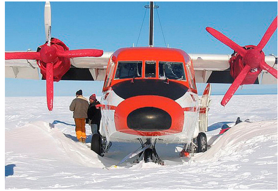
Casa 212 Insulated Engine & Propeller/Spinner Covers