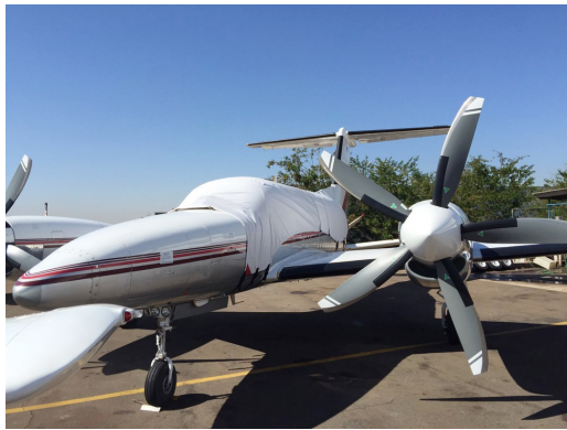
Piper PA-42 Cheyenne IV Canopy Cover

This cover type is made from Silver Acrylic Sunbrella canvas and is 100% lined with a soft and smooth microfiber. Bruce's Custom Covers developed this material combination especially for aircraft protection. The outer material is medium weight and treated for water resistance, UV resistance and anti-static buildup. The inner lining is a very soft and smooth microfiber to prevent scratching. The material is very reflective, and tests show that the cabin interior temperature can be reduced to near-ambient temperature on the hottest of days. It is water, ice and snow repellent, yet breathable to allow moisture to escape from between the cover and the aircraft surface.