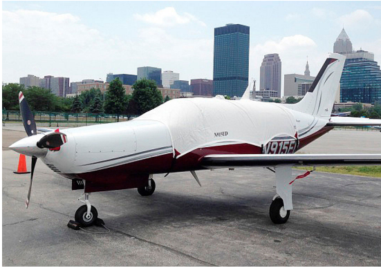
Piper Mirage Canopy Cover, Engine Plugs

Travel Covers are made with Silver Solution-Dyed Polyester fabric and only lined over the windshield to save weight. The material is lightweight and more compact for easy stowage in the aircraft. The polyester material is water resistant, but only intended for occasional use outside. We also have an ultra lightweight material available for fitted hangar dust covers. For daily outdoor use, the non-travel Sunbrella Cover is the best choice.