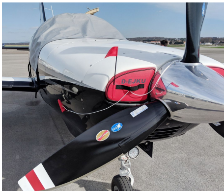
Piper PA46-350P Malibu Mirage Engine Inlet Plugs

Engine Inlet Plugs are custom fit for your Piper PA-46-350P Mirage, Matrix, JetProp intakes, made with heavy-duty vinyl material, and stuffed with a single block of sculpted urethane foam. Each plug has a zipper that allows the foam to be removed and dried if necessary. Engine plugs have warning flags that are visible from the cockpit or 'remove before flight' streamers sewn onto the face of the plugs. Most plugs are imprinted with the aircraft registration number in black for an extra charge. Storage bag NOT included. Engine plugs may be inserted after flight when the engine is still warm. Engine Inlet Plugs are commonly referred to as Cowl Plugs, Intake Plugs, Cowl Blocks, Engine Blocks, and Engine Bungs.