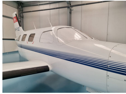
Piper PA-46 Malibu Cockpit Heatshields