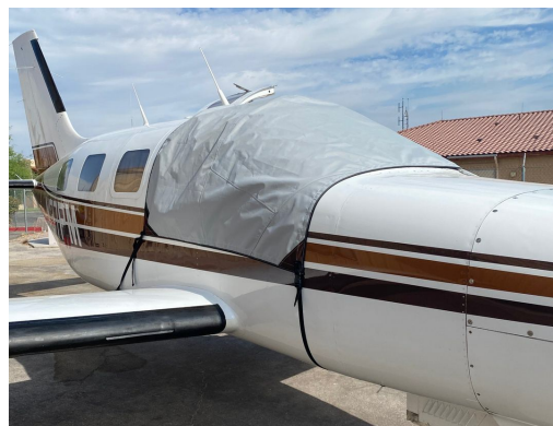
Piper PA46-310P Travel Weight Cockpit Cover