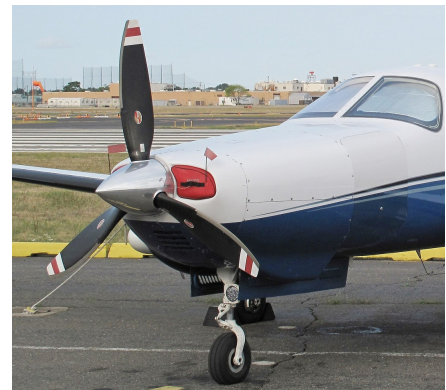
Piper Mirage Engine Plugs