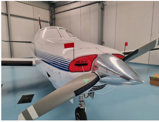
Piper PA-46 Malibu Engine Inlet Plugs