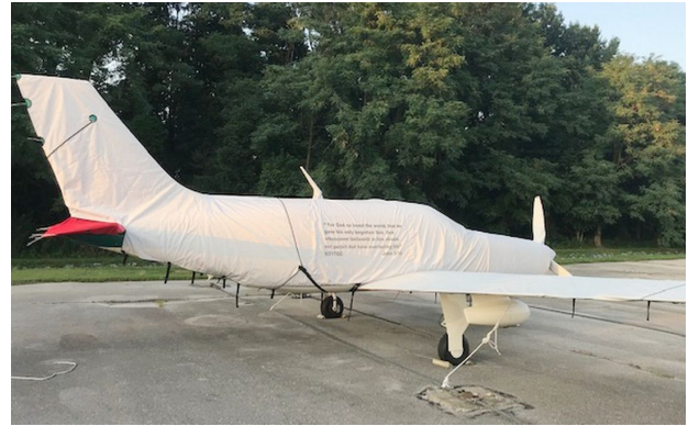
Piper Malibu, Mirage, Meridian Extended Canopy, Engine, Empennage & Wing Covers.