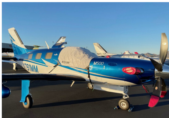
Piper M500 Cockpit Cover

This cover type is made from Silver Acrylic Sunbrella canvas and is 100% lined with a soft and smooth microfiber. Bruce's Custom Covers developed this material combination especially for aircraft protection. The outer material is medium weight and treated for water resistance, UV resistance and anti-static buildup. The inner lining is a very soft and smooth microfiber to prevent scratching. The material is very reflective, and tests show that the cabin interior temperature can be reduced to near-ambient temperature on the hottest of days. It is water, ice and snow repellent, yet breathable to allow moisture to escape from between the cover and the aircraft surface.