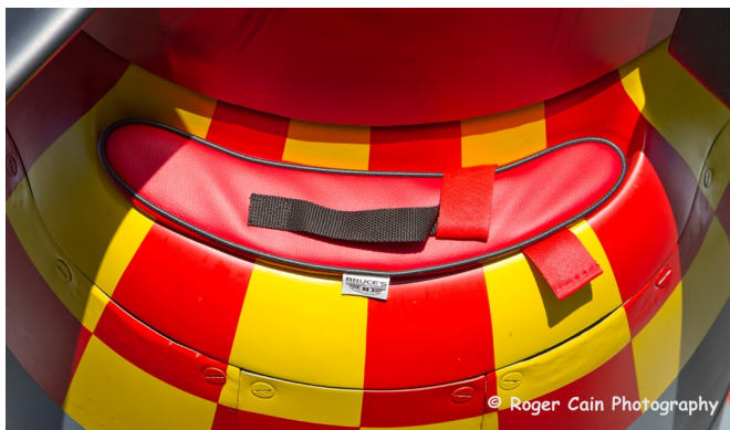
North American P-51 Chin Scoop Plug