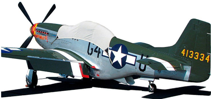
North American P51 Canopy Cover & Exhaust Plugs