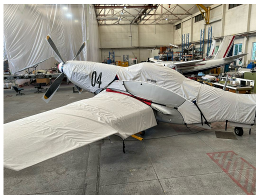
North American Mustang P51 Engine Cover