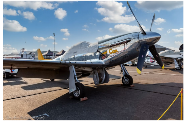
North American P-51 Canopy Cover