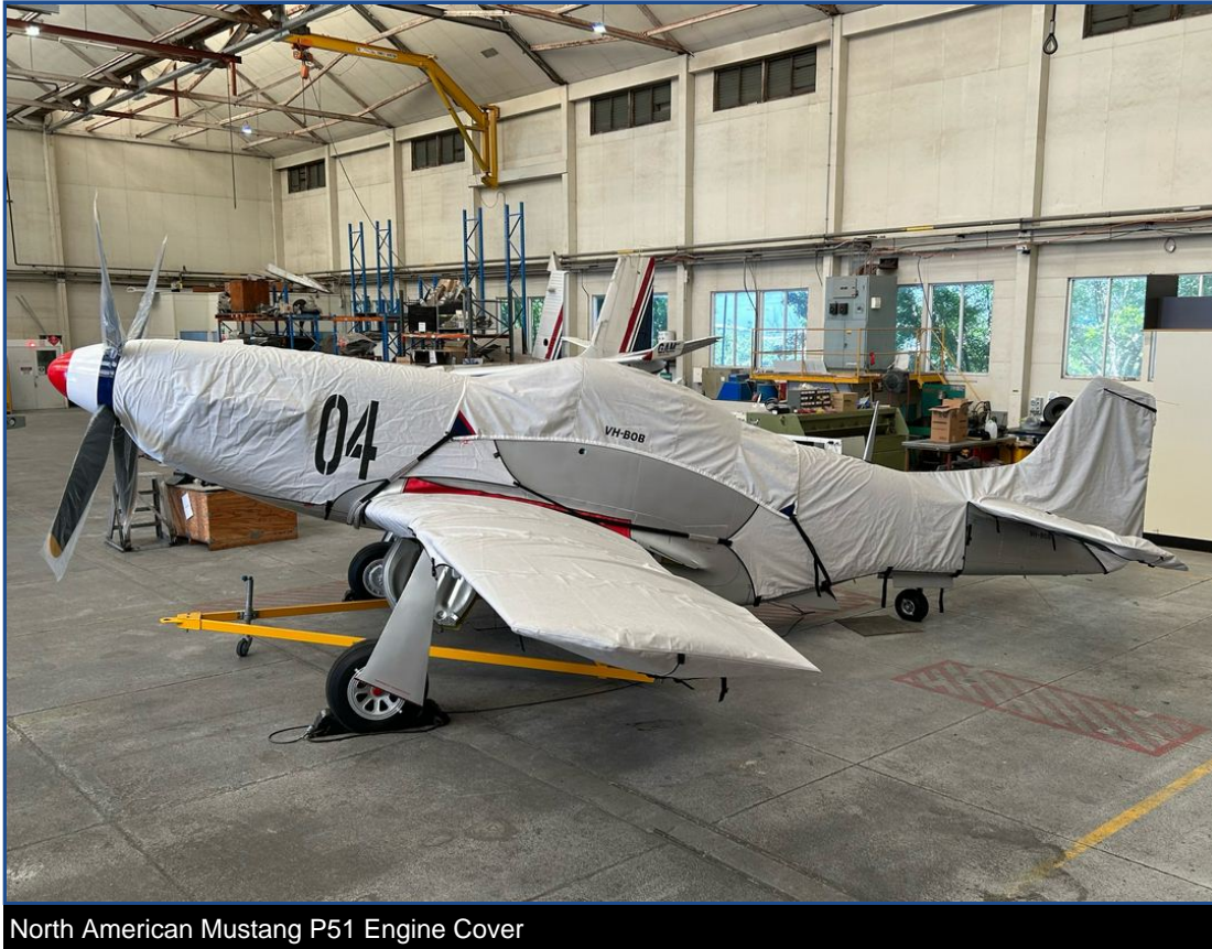
North American Mustang P51 Engine Cover