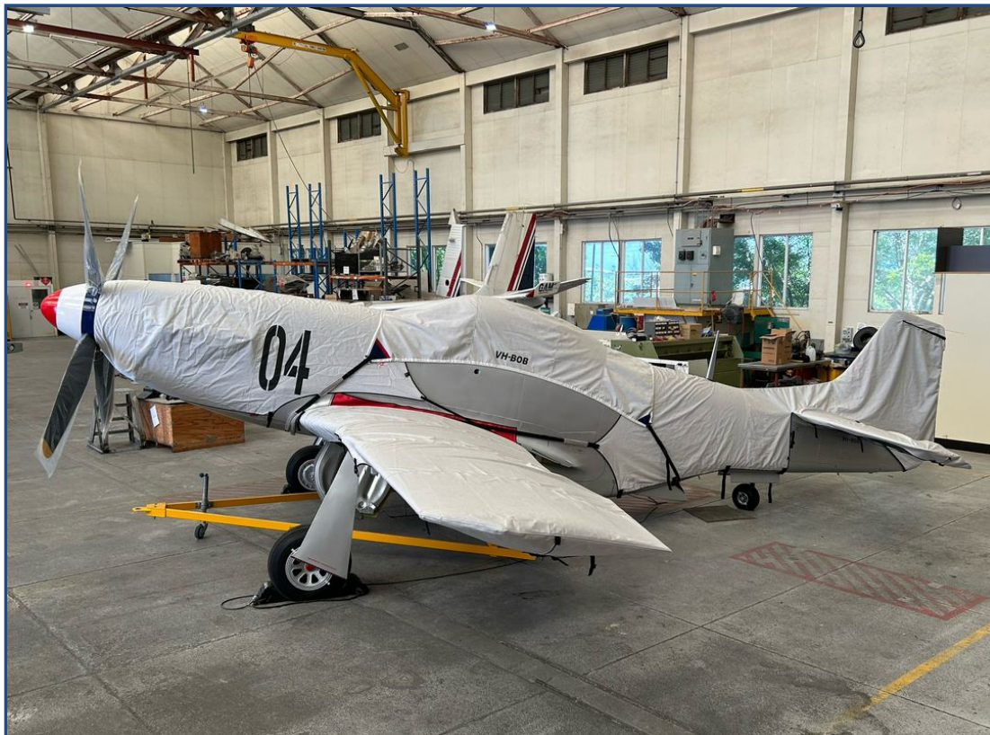
North American Mustang P51 Engine Cover