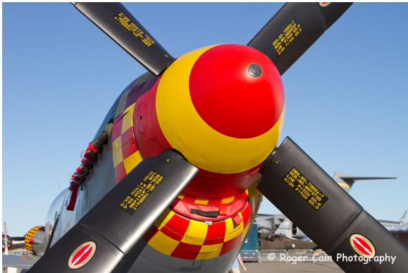
North American P-51 Chin Scoop Plug

Engine Inlet Plugs are custom fit for your North American Mustang P51 intakes, made with heavy-duty vinyl material, and stuffed with a single block of sculpted urethane foam. Each plug has a zipper that allows the foam to be removed and dried if necessary. Engine plugs have warning flags that are visible from the cockpit or 'remove before flight' streamers sewn onto the face of the plugs. Most plugs are imprinted with the aircraft registration number in black for an extra charge. Storage bag NOT included. Engine plugs may be inserted after flight when the engine is still warm. Engine Inlet Plugs are commonly referred to as Cowl Plugs, Intake Plugs, Cowl Blocks, Engine Blocks, and Engine Bungs.