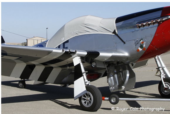
North American P-51 Canopy Cover

Engine Inlet Plugs are custom fit for your North American Mustang P51 intakes, made with heavy-duty vinyl material, and stuffed with a single block of sculpted urethane foam. Each plug has a zipper that allows the foam to be removed and dried if necessary. Engine plugs have warning flags that are visible from the cockpit or 'remove before flight' streamers sewn onto the face of the plugs. Most plugs are imprinted with the aircraft registration number in black for an extra charge. Storage bag NOT included. Engine plugs may be inserted after flight when the engine is still warm. Engine Inlet Plugs are commonly referred to as Cowl Plugs, Intake Plugs, Cowl Blocks, Engine Blocks, and Engine Bung.