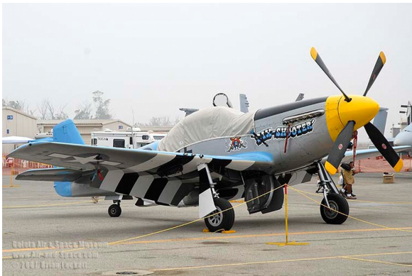
North American P51 Canopy Cover

This cover type is made from Silver Acrylic Sunbrella canvas and is 100% lined with a soft and smooth microfiber. Bruce's Custom Covers developed this material combination especially for aircraft protection. The outer material is medium weight and treated for water resistance, UV resistance and anti-static buildup. The inner lining is a very soft and smooth microfiber to prevent scratching. The material is very reflective, and tests show that the cabin interior temperature can be reduced to near-ambient temperature on the hottest of days. It is water, ice and snow repellent, yet breathable to allow moisture to escape from between the cover and the aircraft surface.