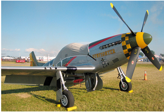
North American P51 Canopy Cover & Belly Scoop Plug

This cover type is made from Silver Acrylic Sunbrella canvas and is 100% lined with a soft and smooth microfiber. Bruce's Custom Covers developed this material combination especially for aircraft protection. The outer material is medium weight and treated for water resistance, UV resistance and anti-static buildup. The inner lining is a very soft and smooth microfiber to prevent scratching. The material is very reflective, and tests show that the cabin interior temperature can be reduced to near-ambient temperature on the hottest of days. It is water, ice and snow repellent, yet breathable to allow moisture to escape from between the cover and the aircraft surface.