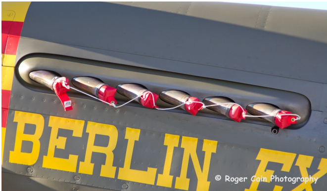
North American P-51 Exhaust Plugs