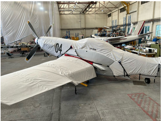
North American Mustang P51 Engine Cover