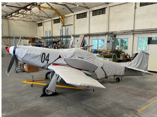
North American Mustang P51 Engine Cover

WINTER USE MATERIAL - Made with Solution-Dyed Polyester fabric, this option is intended for seasonal use to aid in deicing, rain mitigation, or for occasional travel. The material is lighter and more compact, but more susceptible to UV damage and may have a shorter useful life if used continuously outside than the all-year use material.