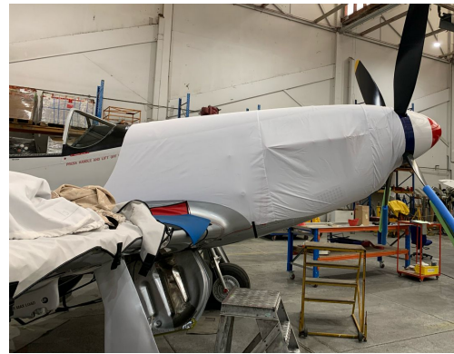
North American P51 Engine Cover, test fit cover