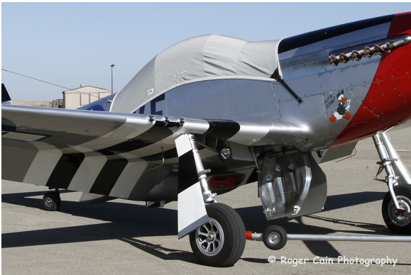
North American P-51 Canopy Cover

non-travel Sunbrella Cover is the best choice.