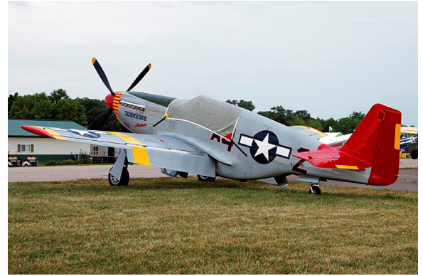
Tuskegee Airmen P51 Canopy Cover