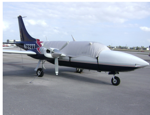
Aerostar Canopy Cover