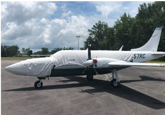
Piper Aerostar Canopy & Nose Covers, Engine Plugs

The Piper PA-601 Aerostar Nose Cover is designed to cover the section of the fuselage forward of the windshield to the tip of the nose. It is secured with belly strapsThis cover type is made from Silver Acrylic Sunbrella canvas and is 100% lined with a soft and smooth microfiber. Bruce's Custom Covers developed this material combination especially for aircraft protection. The outer material is medium weight and treated for water resistance, UV resistance and anti-static buildup. The inner lining is a very soft and smooth microfiber to prevent scratching. The material is very reflective, and tests show that the cabin interior temperature can be reduced to near-ambient temperature on the hottest of days. It is water, ice and snow repellent, yet breathable to allow moisture to escape from between the cover and the aircraft surface.