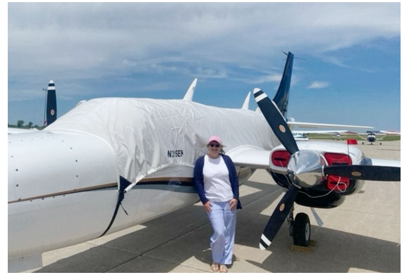
Piper PA-601 Aerostar