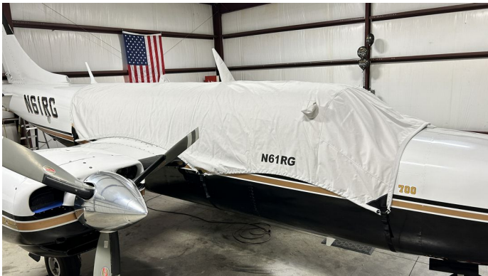
Piper Aerostar 602P Canopy Cover (Windows Only)