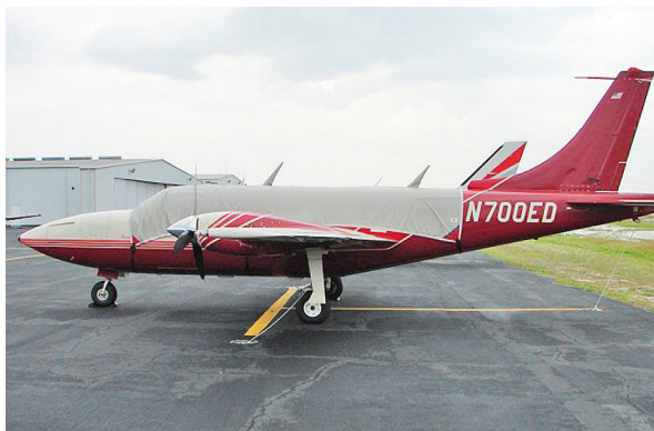
Piper Aerostar Canopy Cover, extended over baggage door