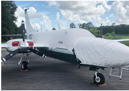
Piper Aerostar Canopy & Nose Covers, Engine Plugs