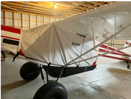
Piper PA-11 Extended Canopy Cover, Over the Top Style

This cover type is made from Silver Acrylic Sunbrella canvas and is 100% lined with a soft and smooth microfiber. Bruce's Custom Covers developed this material combination especially for aircraft protection. The outer material is medium weight and treated for water resistance, UV resistance and anti-static buildup. The inner lining is a very soft and smooth microfiber to prevent scratching. The material is very reflective, and tests show that the cabin interior temperature can be reduced to near-ambient temperature on the hottest of days. It is water, ice and snow repellent, yet breathable to allow moisture to escape from between the cover and the aircraft surface.