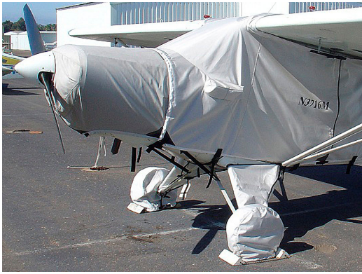
Piper PA-12 Landing Gear Covers