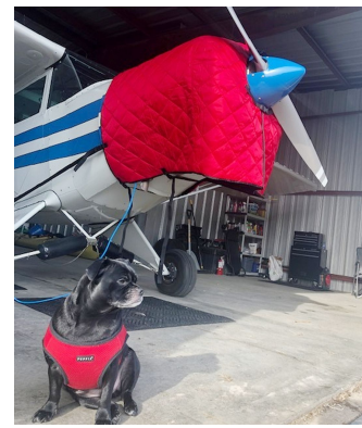
Piper PA-12 Insulated Hangar Blanket