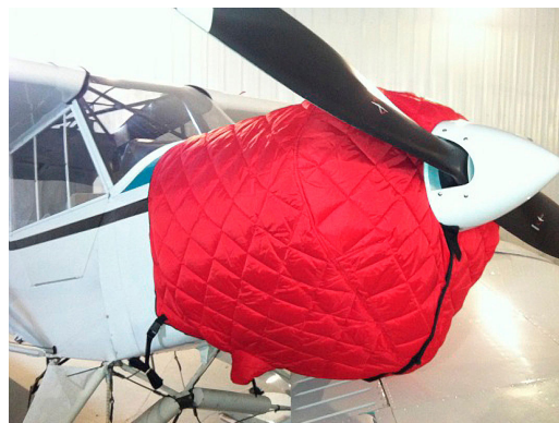
Piper Super Cub Insulated Engine Cover

Engine Inlet Plugs are custom fit for your Piper PA-11 Cub Special intakes, made with heavy-duty vinyl material, and stuffed with a single block of sculpted urethane foam. Each plug has a zipper that allows the foam to be removed and dried if necessary. Engine plugs have warning flags that are visible from the cockpit or 'remove before flight' streamers sewn onto the face of the plugs. Most plugs are imprinted with the aircraft registration number in black for an extra charge. Storage bag NOT included. Engine plugs may be inserted after flight when the engine is still warm. Engine Inlet Plugs are commonly referred to as Cowl Plugs, Intake Plugs, Cowl Blocks, Engine Blocks, and Engine Bungs.