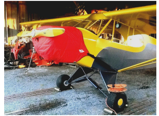
Prop Cover, Engine Cover, Canopy Cover, Wing Covers and Empennage Cover Piper PA-11 Cub Special Insulated Engine Cover