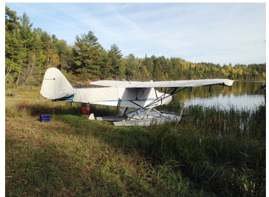
Piper PA-11 Cover Set