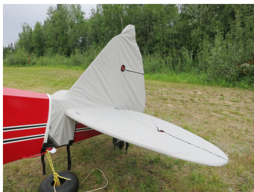
Piper PA-12 Abbreviated Empennage Cover