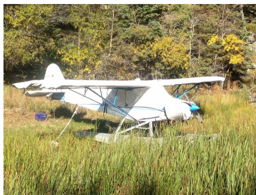
Piper PA-11 Cover Set