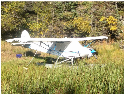
Piper PA-11 Cover Set