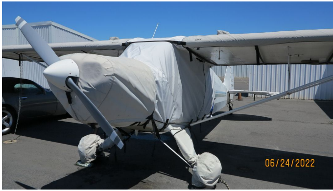
Piper PA-12 Over-Top Canopy Cover, Engine, Wing & Landing Gear Covers