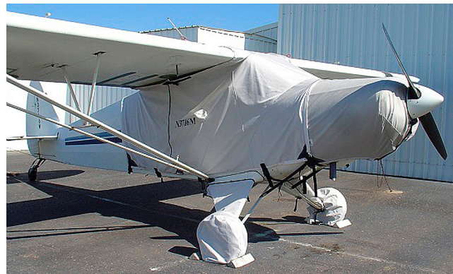
Piper PA-12 Extended Canopy, Engine & Landing Gear Covers