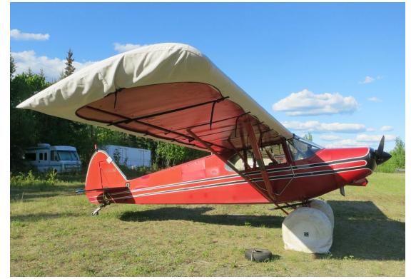
Piper PA-12 Wing Covers