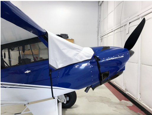
Cub Crafters CC-11 Windshield Cover

This cover type is made from Silver Acrylic Sunbrella canvas and is 100% lined with a soft and smooth microfiber. Bruce's Custom Covers developed this material combination especially for aircraft protection. The outer material is medium weight and treated for water resistance, UV resistance and anti-static buildup. The inner lining is a very soft and smooth microfiber to prevent scratching. The material is very reflective, and tests show that the cabin interior temperature can be reduced to near-ambient temperature on the hottest of days. It is water, ice and snow repellent, yet breathable to allow moisture to escape from between the cover and the aircraft surface.