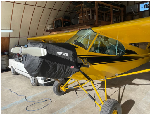
Piper PA-11 Replica Insulated Engine Cover