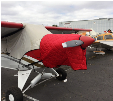
FOR INTERIOR USE. Cub Crafters CC-11 Insulated Hangar Blanket, available in Red or Silver

This cover type is made from Silver Acrylic Sunbrella canvas and is 100% lined with a soft and smooth microfiber. Bruce's Custom Covers developed this material combination especially for aircraft protection. The outer material is medium weight and treated for water resistance, UV resistance and anti-static buildup. The inner lining is a very soft and smooth microfiber to prevent scratching. The material is very reflective, and tests show that the cabin interior temperature can be reduced to near-ambient temperature on the hottest of days. It is water, ice and snow repellent, yet breathable to allow moisture to escape from between the cover and the aircraft surface.