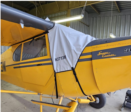
Piper PA-12: Super Cruiser, J5 Cub Windshield/Skylight Cover