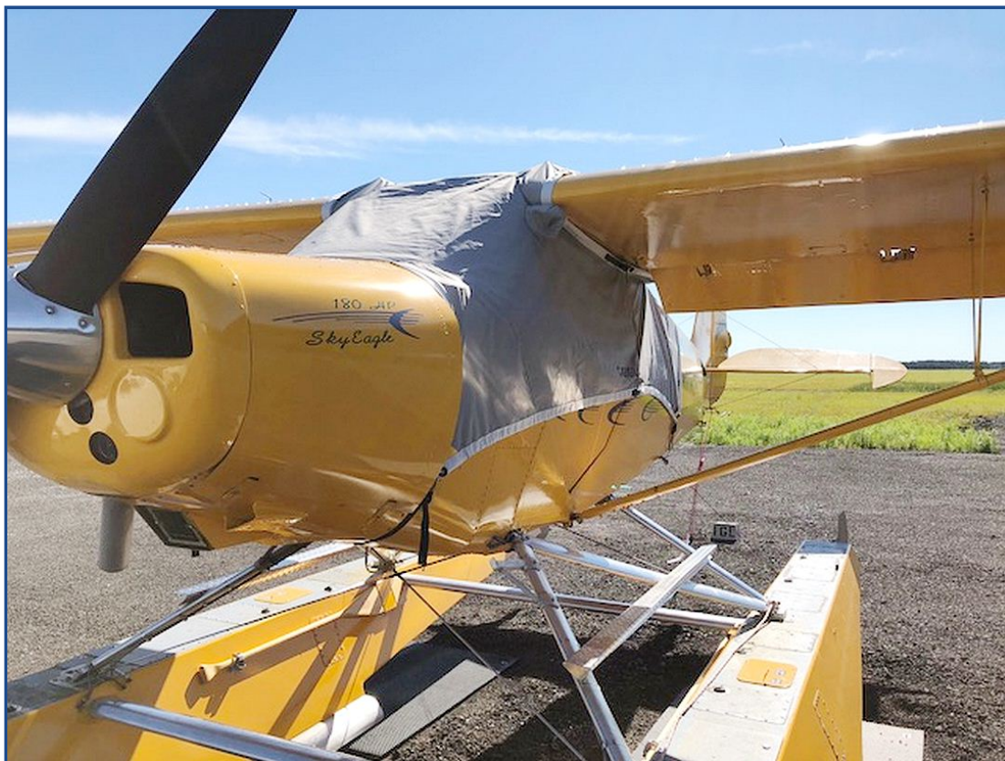
Sportsman 2+2 Wag Aero Light Weight Over the Top Travel Canopy Cover