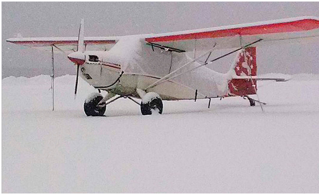
Bellanca Citabria Over-Top Canopy Cover, extended to tail