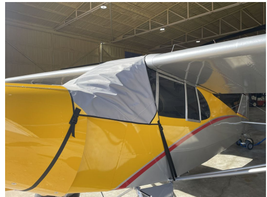
Piper PA-18 Windshield/Skylight Cover