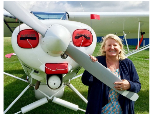
Piper PA-18 Super Cub Engine Inlet Plugs