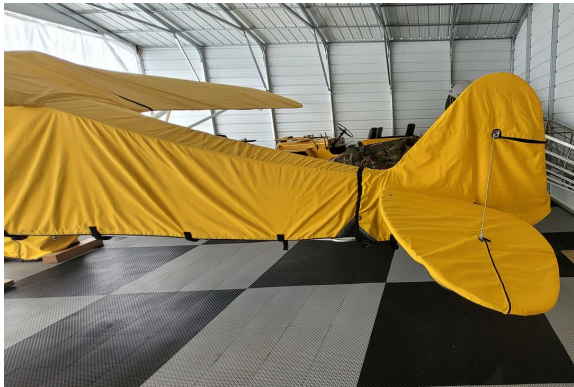
Piper PA-18 Empennage Cover

WINTER USE MATERIAL - Made with Solution-Dyed Polyester fabric, this option is intended for seasonal use to aid in deicing, rain mitigation, or for occasional travel. The material is lighter and more compact, but more susceptible to UV damage and may have a shorter useful life if used continuously outside than the all-year use material.