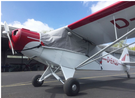
Piper Super Cub Travel Weight Canopy Cover

This cover type is made from Silver Acrylic Sunbrella canvas and is 100% lined with a soft and smooth microfiber. Bruce's Custom Covers developed this material combination especially for aircraft protection. The outer material is medium weight and treated for water resistance, UV resistance and anti-static buildup. The inner lining is a very soft and smooth microfiber to prevent scratching. The material is very reflective, and tests show that the cabin interior temperature can be reduced to near-ambient temperature on the hottest of days. It is water, ice and snow repellent, yet breathable to allow moisture to escape from between the cover and the aircraft surface.