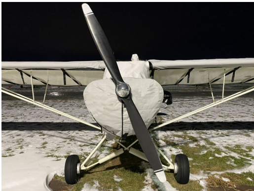
PA-18 Super Cub Insulated Engine Cover