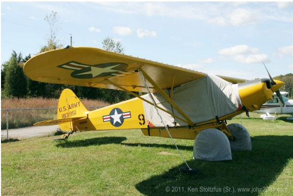
Piper L-21b Extended Canopy Cover, Tire Covers

ALL-YEAR USE MATERIAL - Made with Silver Acrylic Sunbrella canvas, the all-year use material is the best option for sun protection and cover longevity. This heavier more durable material is intended for all weather conditions, such as rain and snow or lots of sun.