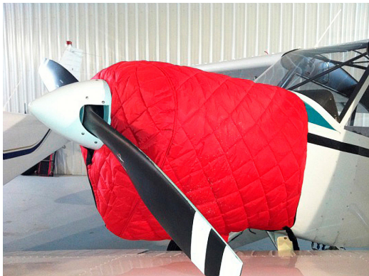
Piper Super Cub Insulated Engine Cover

This cover type is made from Silver Acrylic Sunbrella canvas and is 100% lined with a soft and smooth microfiber. Bruce's Custom Covers developed this material combination especially for aircraft protection. The outer material is medium weight and treated for water resistance, UV resistance and anti-static buildup. The inner lining is a very soft and smooth microfiber to prevent scratching. The material is very reflective, and tests show that the cabin interior temperature can be reduced to near-ambient temperature on the hottest of days. It is water, ice and snow repellent, yet breathable to allow moisture to escape from between the cover and the aircraft surface.