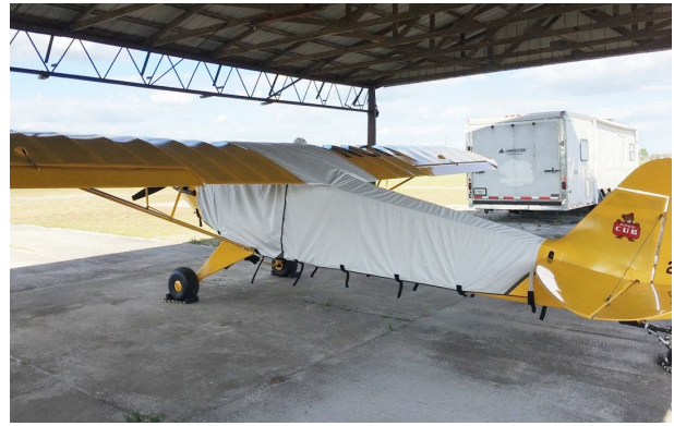
Piper J3 Cub Extended Canopy Cover, also extended back to tail planes.