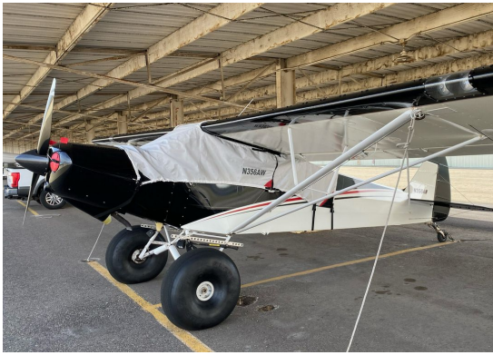
Piper PA-18 Super Cub Canopy Cover, Over Top Type