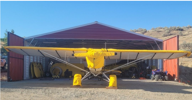
Piper PA-18 All Weather Cover Set