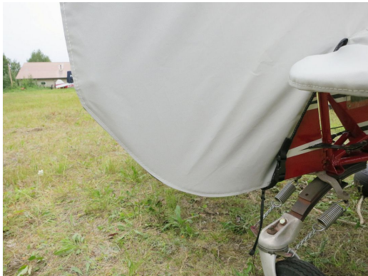
Piper PA-12 Abbreviated Empennage Cover