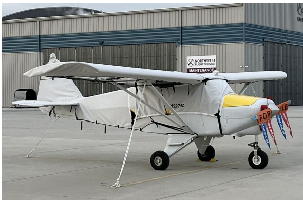
Piper PA-22-108, Engine Inlet plugs