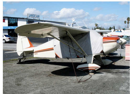
Piper PA-22 Extended Canopy Cover