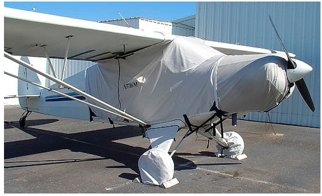
Piper PA-12 Extended Canopy, Engine & Landing Gear Covers