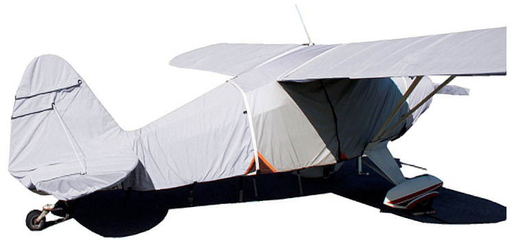
Piper Pacer Full Cover Set