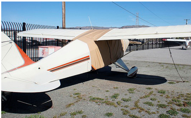
Piper PA-22-150 Pacer Extended Canopy, Engine & Prop/Spinner Covers

This cover type is made from Silver Acrylic Sunbrella canvas and is 100% lined with a soft and smooth microfiber. Bruce's Custom Covers developed this material combination especially for aircraft protection. The outer material is medium weight and treated for water resistance, UV resistance and anti-static buildup. The inner lining is a very soft and smooth microfiber to prevent scratching. The material is very reflective, and tests show that the cabin interior temperature can be reduced to near-ambient temperature on the hottest of days. It is water, ice and snow repellent, yet breathable to allow moisture to escape from between the cover and the aircraft surface.