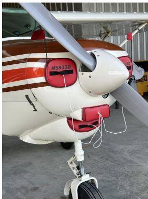
Piper PA-22-150 Engine Inlet Plugs

Engine Inlet Plugs are custom fit for your Piper Clipper, Pacer, Tri-Pacer, Vagabond, Colt: PA-15, 16, 20, 22 intakes, made with heavy-duty vinyl material, and stuffed with a single block of sculpted urethane foam. Each plug has a zipper that allows the foam to be removed and dried if necessary. Engine plugs have warning flags that are visible from the cockpit or 'remove before flight' streamers sewn onto the face of the plugs. Most plugs are imprinted with the aircraft registration number in black for an extra charge. Storage bag NOT included. Engine plugs may be inserted after flight when the engine is still warm. Engine Inlet Plugs are commonly referred to as Cowl Plugs, Intake Plugs, Cowl Blocks, Engine Blocks, and Engine Bung.