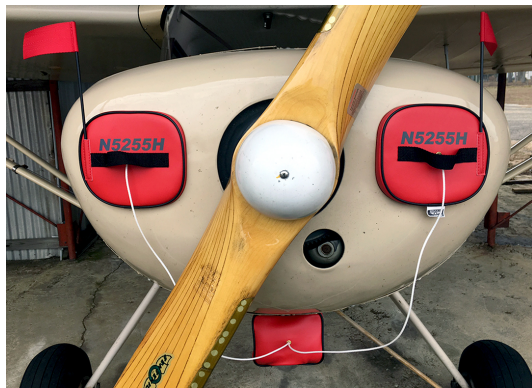
Piper PA-16 Engine Inlet Plugs

Engine Inlet Plugs are custom fit for your Piper Clipper, Pacer, Tri-Pacer, Vagabond, Colt: PA-15, 16, 20, 22 intakes, made with heavy-duty vinyl material, and stuffed with a single block of sculpted urethane foam. Each plug has a zipper that allows the foam to be removed and dried if necessary. Engine plugs have warning flags that are visible from the cockpit or 'remove before flight' streamers sewn onto the face of the plugs. Most plugs are imprinted with the aircraft registration number in black for an extra charge. Storage bag NOT included. Engine plugs may be inserted after flight when the engine is still warm. Engine Inlet Plugs are commonly referred to as Cowl Plugs, Intake Plugs, Cowl Blocks, Engine Blocks, and Engine Bunges.