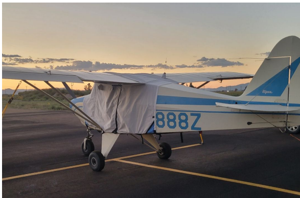
Piper PA-22 Colt Extended Canopy Cover

This cover type is made from Silver Acrylic Sunbrella canvas and is 100% lined with a soft and smooth microfiber. Bruce's Custom Covers developed this material combination especially for aircraft protection. The outer material is medium weight and treated for water resistance, UV resistance and anti-static buildup. The inner lining is a very soft and smooth microfiber to prevent scratching. The material is very reflective, and tests show that the cabin interior temperature can be reduced to near-ambient temperature on the hottest of days. It is water, ice and snow repellent, yet breathable to allow moisture to escape from between the cover and the aircraft surface.