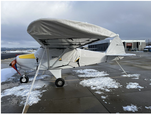
Piper Tri-Pacer Canopy, Wing & Engine Covers