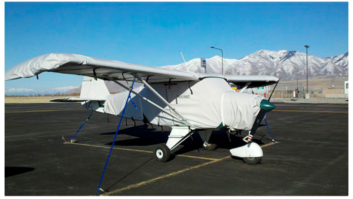
Engine, Extended Over-the-top Canopy, Wing and Empennage Covers