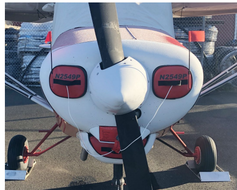
Piper PA-20 Engine Inlet Plugs