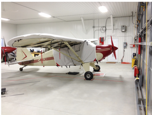
Piper PA-20 Extended Canopy Cover, Wing Covers

Travel Covers are made with Silver Solution-Dyed Polyester fabric and only lined over the windshield to save weight. The material is lightweight and more compact for easy stowage in the aircraft. The polyester material is water resistant, but only intended for occasional use outside. We also have an ultra lightweight material available for fitted hangar dust covers. For daily outdoor use, the non-travel Sunbrella Cover is the best choice.