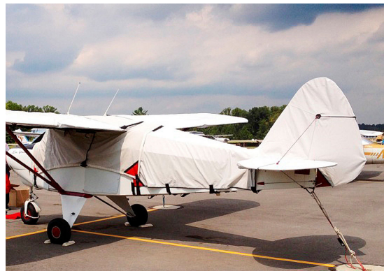
Piper Tri-Pacer Canopy, Empennage and Wing Covers