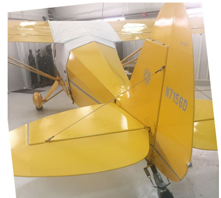
Piper Pacer Over-Top Canopy Cover