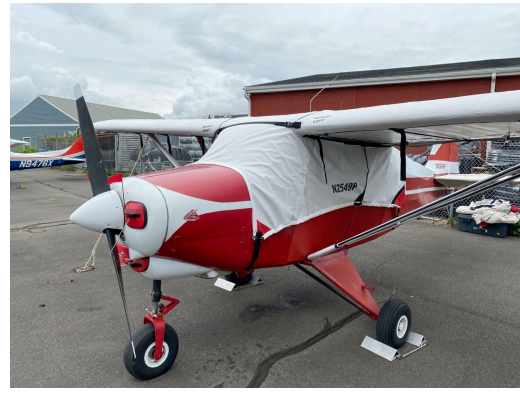
Piper Tri-Pacer PA22-150 Canopy & Wing Covers, Engine Plugs