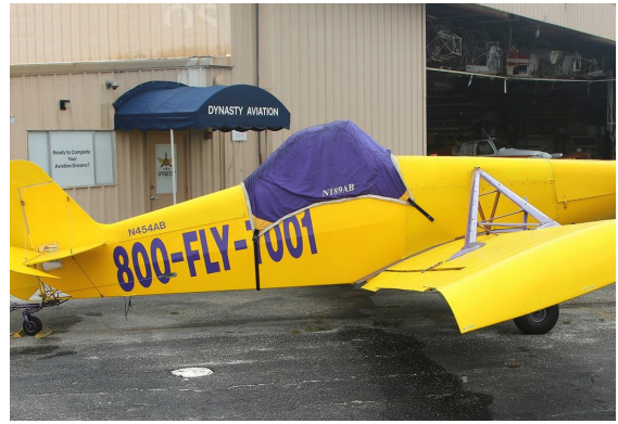
Piper PA-25 Pawnee Canopy Cover