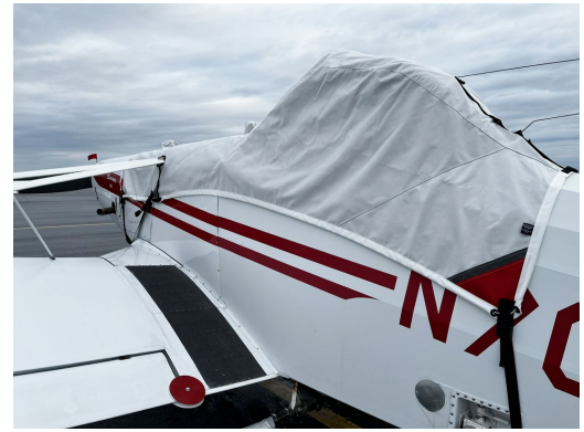
Piper Pawnee PA25 Canopy/Hopper Cover