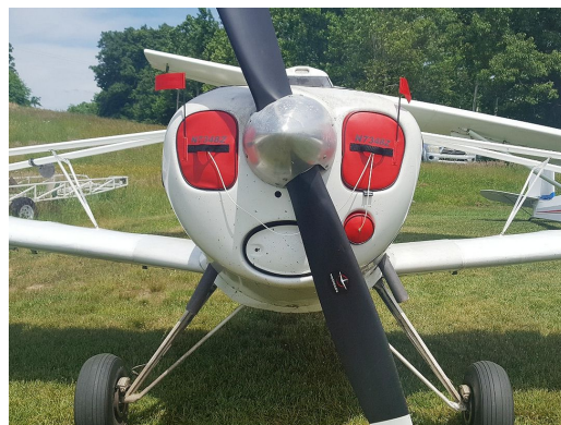
Piper Pa-25-235 Engine Inlet Plugs