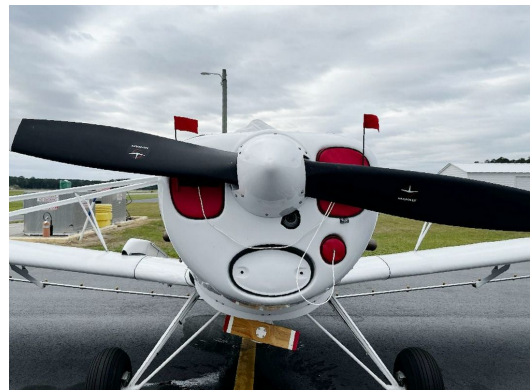
Piper Pawnee PA25 Engine Inlet Plugs