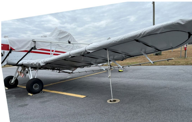
Piper PA-25 Pawnee Cover Set

WINTER USE MATERIAL - Made with Solution-Dyed Polyester fabric, this option is intended for seasonal use to aid in deicing, rain mitigation, or for occasional travel. The material is lighter and more compact, but more susceptible to UV damage and may have a shorter useful life if used continuously outside than the all-year use material.