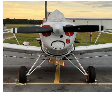
Piper PA-25 Pawnee Canopy/Hopper Cover