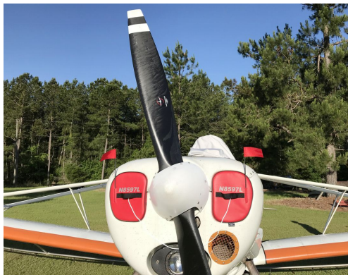
Piper Pawnee PA-25 Engine Inlet Plugs

Engine Inlet Plugs are custom fit for your Piper Pawnee PA-25 intakes, made with heavy-duty vinyl material, and stuffed with a single block of sculpted urethane foam. Each plug has a zipper that allows the foam to be removed and dried if necessary. Engine plugs have warning flags that are visible from the cockpit or 'remove before flight' streamers sewn onto the face of the plugs. Most plugs are imprinted with the aircraft registration number in black for an extra charge. Storage bag NOT included. Engine plugs may be inserted after flight when the engine is still warm. Engine Inlet Plugs are commonly referred to as Cowl Plugs, Intake Plugs, Cowl Blocks, Engine Blocks, and Engine Bungs.