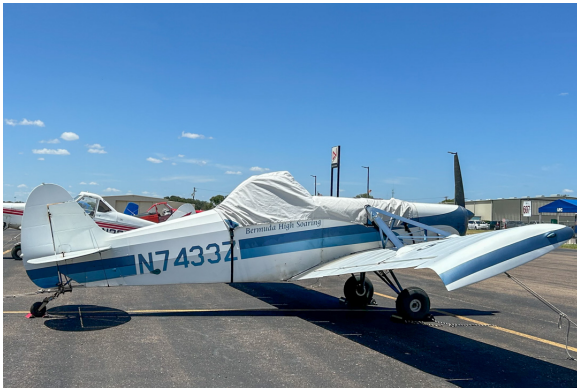
Piper Pawnee PA-25 Canopy/Hopper Cover