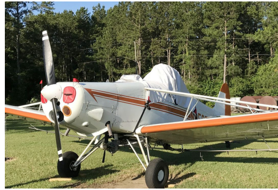
Piper Pawnee PA-25 Canopy/Hopper Cover, Engine Plugs