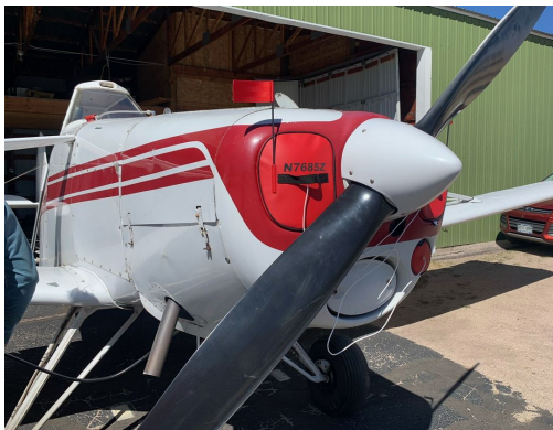
Piper PA-25 Pawnee Engine Plugs

Engine Inlet Plugs are custom fit for your Piper Pawnee PA-25 intakes, made with heavy-duty vinyl material, and stuffed with a single block of sculpted urethane foam. Each plug has a zipper that allows the foam to be removed and dried if necessary. Engine plugs have warning flags that are visible from the cockpit or 'remove before flight' streamers sewn onto the face of the plugs. Most plugs are imprinted with the aircraft registration number in black for an extra charge. Storage bag NOT included. Engine plugs may be inserted after flight when the engine is still warm. Engine Inlet Plugs are commonly referred to as Cowl Plugs, Intake Plugs, Cowl Blocks, Engine Blocks, and Engine Bungs.