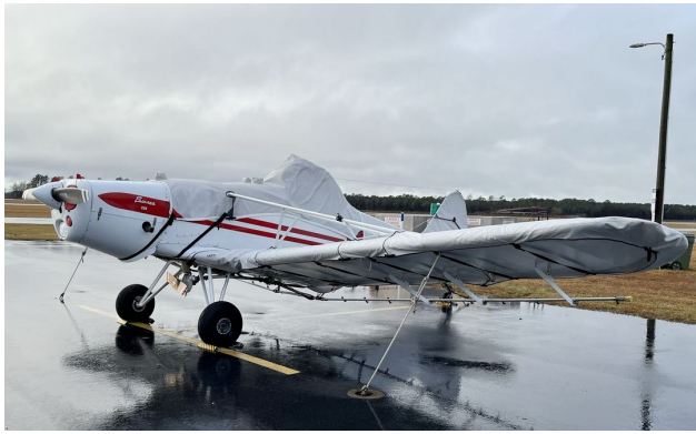
Piper Pawnee Canopy/Hopper, Wing & Empennage Covers