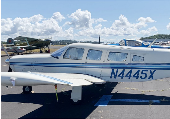
Piper PA32-300 HeatShield Set