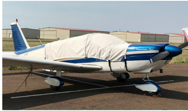
Piper Cherokee Six Canopy Cover with forward bib to cover baggage door.