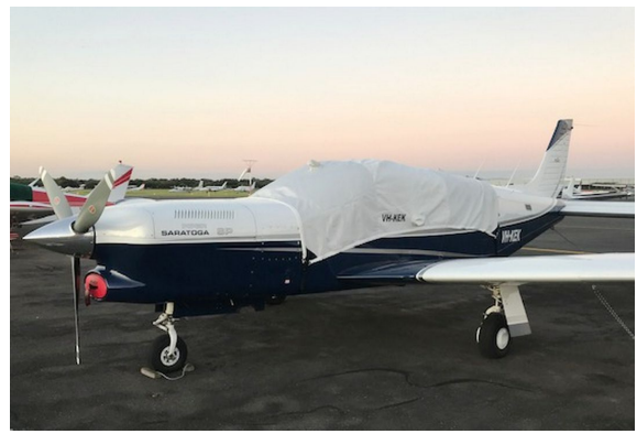
Piper Saratoga SP PA32R Canopy Cover