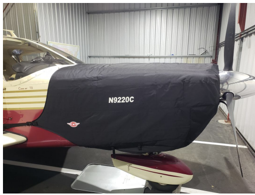
Piper PA32-300 Insulated Engine Cover