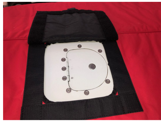
Piper PA-32-300 Insulated Engine Cover