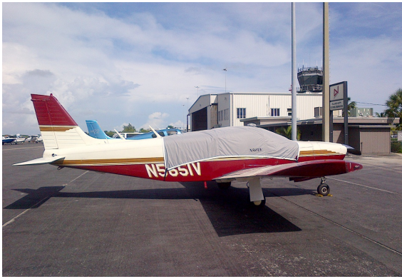
Piper PA-32 Light Weight Travel Cover