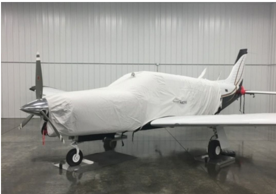
Piper PA-32 Fuselage Cover (Canopy/Engine Cover, Extends to Dorsal)