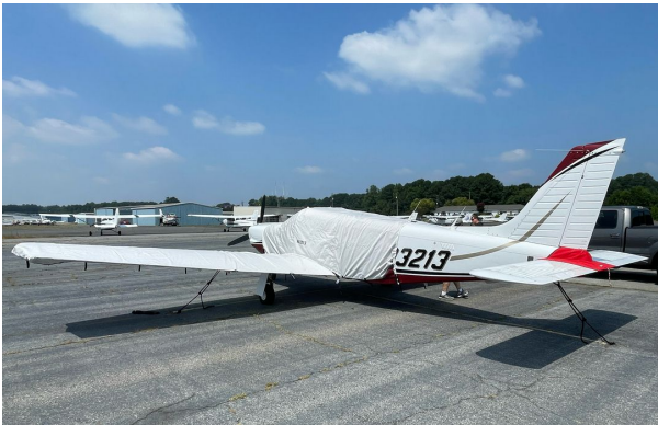
Piper PA-28 Extended Canopy/Engine, Wing & Horizontal Stabilizer Covers Piper PA-32R-301 Extended Canopy Cover, Wing & Tailcone Covers