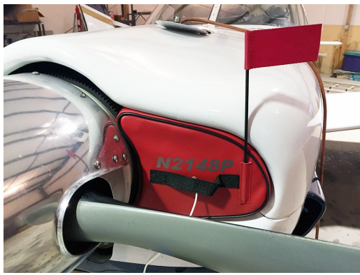
Piper PA-32 Saratoga/Cherokee 6 Engine Inlet Plugs