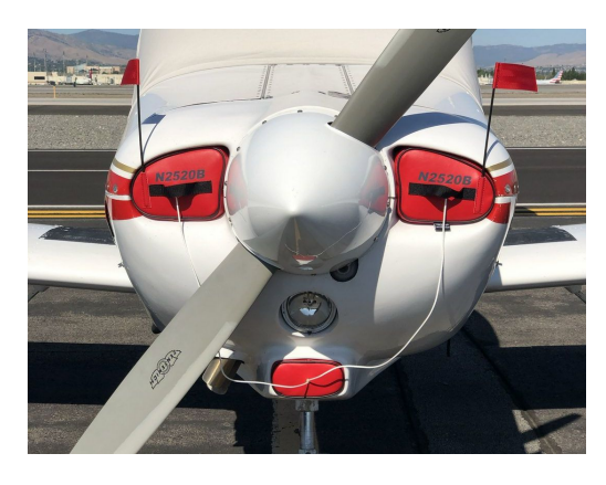
Piper Tomahawk Engine Inlet Plugs, set of 3