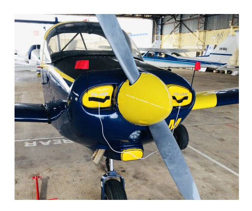
Piper PA-38 Tomahawk Engine Inlet Plugs with custom color