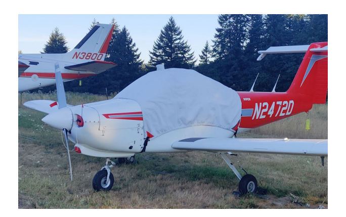
Piper PA-38 Tomahawk Canopy Cover