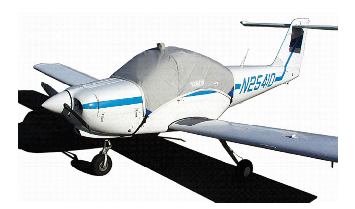
Piper Tomahawk Canopy Cover

This cover type is made from Silver Acrylic Sunbrella canvas and is 100% lined with a soft and smooth microfiber. Bruce's Custom Covers developed this material combination especially for aircraft protection. The outer material is medium weight and treated for water resistance, UV resistance and anti-static buildup. The inner lining is a very soft and smooth microfiber to prevent scratching. The material is very reflective, and tests show that the cabin interior temperature can be reduced to near-ambient temperature on the hottest of days. It is water, ice and snow repellent, yet breathable to allow moisture to escape from between the cover and the aircraft surface.