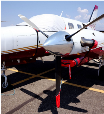
Piper Cheyenne Cockpit Cover, Engine Plugs, Prop Tie/Exhaust Covers

Travel Covers are made with Silver Solution-Dyed Polyester fabric and only lined over the windshield to save weight. The material is lightweight and more compact for easy stowage in the aircraft. The polyester material is water resistant, but only intended for occasional use outside. We also have an ultra lightweight material available for fitted hangar dust covers. For daily outdoor use, the non-travel Sunbrella Cover is the best choice.