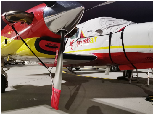
Piper PA-42 Cheyenne III Cockpit Cover, Prop Tie/Exhaust Cover, Inlet Plugs