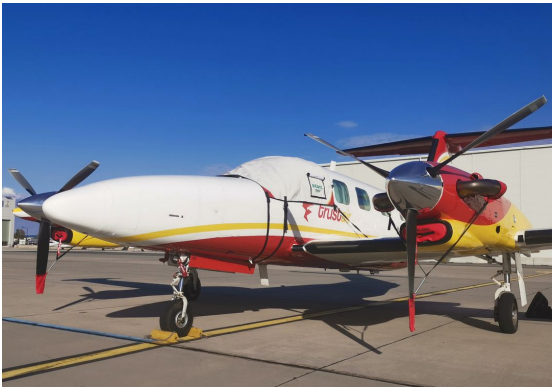
Piper PA-42 Cheyenne III Prop Tie/Exhaust Cover, Inlet Plugs Piper PA-42 Cheyenne III Engine Plugs, Prop Ties, Cockpit Cover