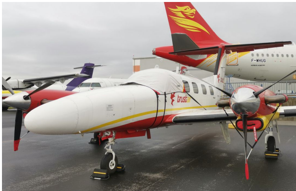
Piper PA-42 Cheyenne III Cockpit Cover, Prop Tie/Exhaust Cover, Inlet Plugs

This cover type is made from Silver Acrylic Sunbrella canvas and is 100% lined with a soft and smooth microfiber. Bruce's Custom Covers developed this material combination especially for aircraft protection. The outer material is medium weight and treated for water resistance, UV resistance and anti-static buildup. The inner lining is a very soft and smooth microfiber to prevent scratching. The material is very reflective, and tests show that the cabin interior temperature can be reduced to near-ambient temperature on the hottest of days. It is water, ice and snow repellent, yet breathable to allow moisture to escape from between the cover and the aircraft surface.