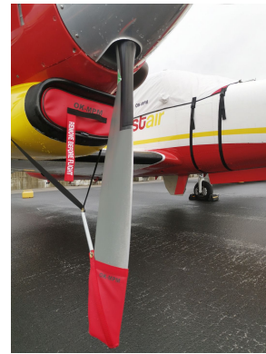
Piper PA-42 Cheyenne III Engine Plugs, Prop Ties, Cockpit Cover Piper PA-42 Cheyenne III Prop Tie/Exhaust Cover, Inlet Plugs