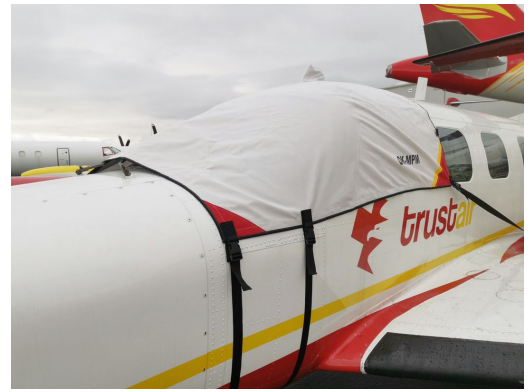
Piper Mojave Canopy Cover and Engine Inlet Plugs, Cockpit Cover (Top to Bottom) Piper PA-42 Cheyenne III Cockpit Cover