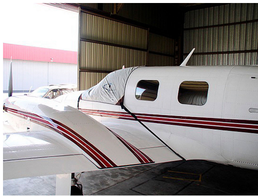
Piper Cheyenne Cockpit Cover

This cover type is made from Silver Acrylic Sunbrella canvas and is 100% lined with a soft and smooth microfiber. Bruce's Custom Covers developed this material combination especially for aircraft protection. The outer material is medium weight and treated for water resistance, UV resistance and anti-static buildup. The inner lining is a very soft and smooth microfiber to prevent scratching. The material is very reflective, and tests show that the cabin interior temperature can be reduced to near-ambient temperature on the hottest of days. It is water, ice and snow repellent, yet breathable to allow moisture to escape from between the cover and the aircraft surface.