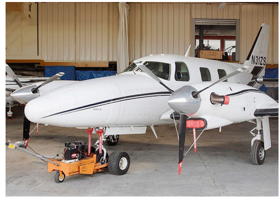
Piper PA-42 Cheyenne III Engine Plugs, Prop Ties, Cockpit Cover Piper Cheyenne IIXL Prop Tie/Exhaust Covers, Intake Plugs