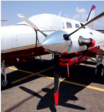
Piper Cheyenne Cockpit Cover, Engine Plugs, Prop Tie/Exhaust Covers

Travel Covers are made with Silver Solution-Dyed Polyester fabric and only lined over the windshield to save weight. The material is lightweight and more compact for easy stowage in the aircraft. The polyester material is water resistant, but only intended for occasional use outside. We also have an ultra lightweight material available for fitted hangar dust covers. For daily outdoor use, the non-travel Sunbrella Cover is the best choice.