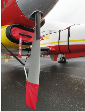
Piper PA-42 Cheyenne III Prop Tie/Exhaust Cover, Inlet Plugs

Engine Inlet Plugs are custom fit for your Piper PA-42 Cheyenne III intakes, made with heavy-duty vinyl material, and stuffed with a single block of sculpted urethane foam. Each plug has a zipper that allows the foam to be removed and dried if necessary. Engine plugs have warning flags that are visible from the cockpit or 'remove before flight' streamers sewn onto the face of the plugs. Most plugs are imprinted with the aircraft registration number in black for an extra charge. Storage bag NOT included. Engine plugs may be inserted after flight when the engine is still warm. Engine Inlet Plugs are commonly referred to as Cowl Plugs, Intake Plugs, Cowl Blocks, Engine Blocks, and Engine Bunges.