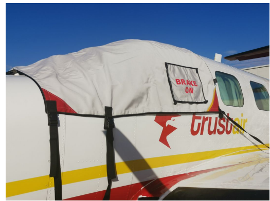
Piper PA-42 Cheyenne III Cockpit Cover