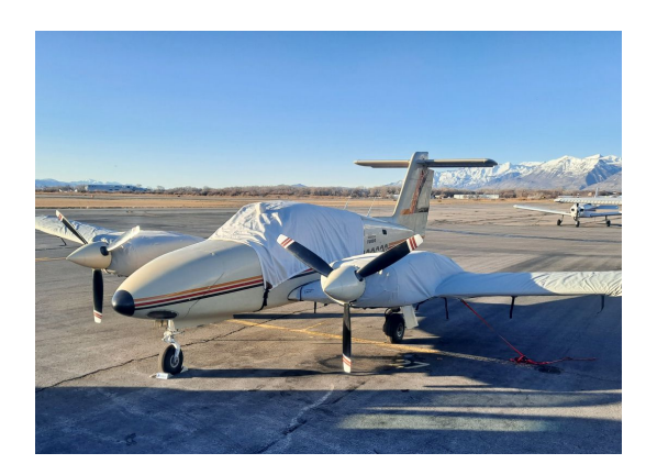
Piper PA-44 Wing/Engine Covers, Canopy Cover

WINTER USE MATERIAL - Made with Solution-Dyed Polyester fabric, this option is intended for seasonal use to aid in deicing, rain mitigation, or for occasional travel. The material is lighter and more compact, but more susceptible to UV damage and may have a shorter useful life if used continuously outside than the all-year use material.