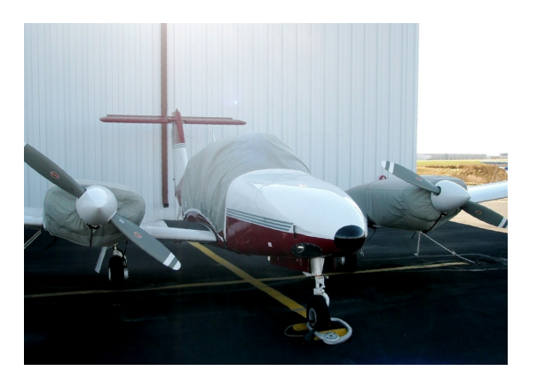
Piper Seminole Canopy and Engine Covers