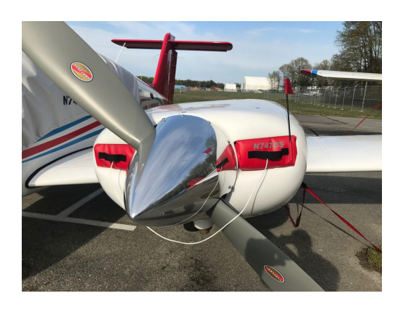
Piper Seminole Engine Plugs