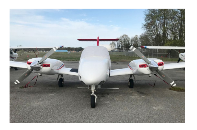
Piper Seminole Engine Plugs