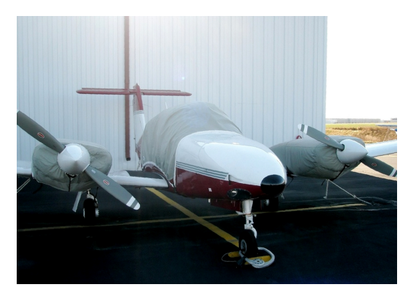
Piper Seminole Canopy and Engine Covers