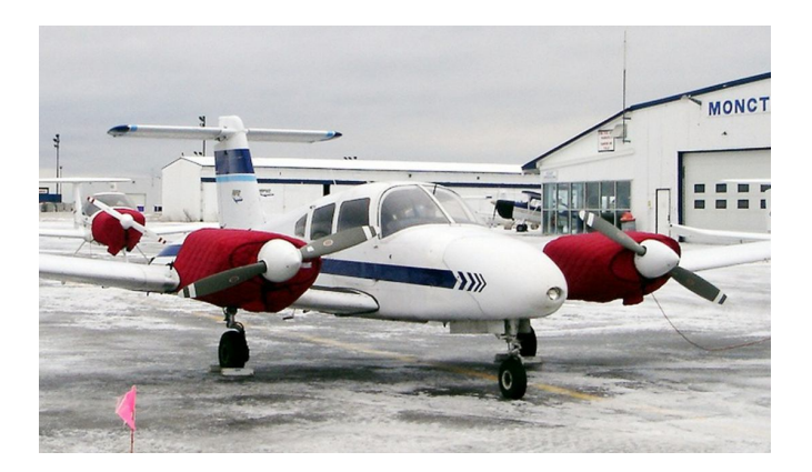
Piper Seminole Insulated Engine Covers