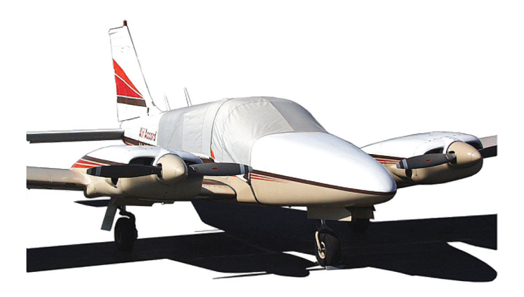
Piper Seneca PA-34 Canopy Cover

Travel Covers are made with Silver Solution-Dyed Polyester fabric and only lined over the windshield to save weight. The material is lightweight and more compact for easy stowage in the aircraft. The polyester material is water resistant, but only intended for occasional use outside. We also have an ultra lightweight material available for fitted hangar dust covers. For daily outdoor use, the non-travel Sunbrella Cover is the best choice.