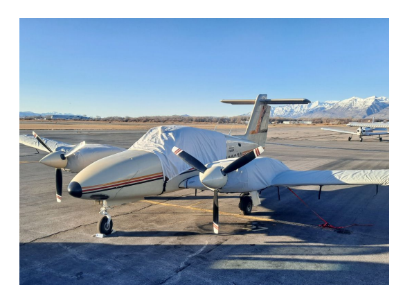
Piper PA-44 Wing/Engine Covers, Canopy Cover