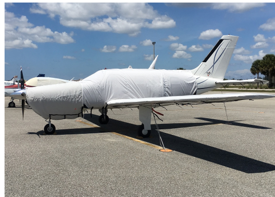
Piper Malibu Extended Canopy Cover, Engine, Wing & Horiz. Stab. Covers