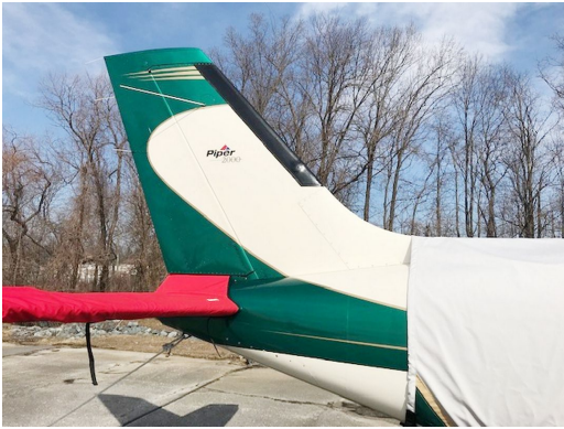
Piper Malibu/Mirage Horizontal Stabilizer/Tailcone Cover

WINTER USE MATERIAL - Made with Solution-Dyed Polyester fabric, this option is intended for seasonal use to aid in deicing, rain mitigation, or for occasional travel. The material is lighter and more compact, but more susceptible to UV damage and may have a shorter useful life if used continuously outside than the all-year use material.