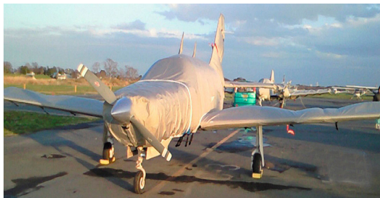
Piper PA-46 Malibu Complete Cover Set