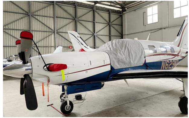
Piper PA-46-500TP Engine Cowling Top Plug