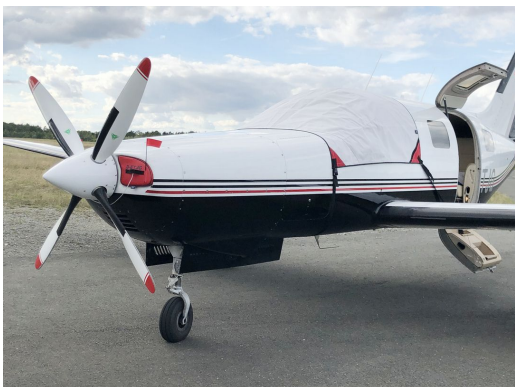
Piper PA-46-50P Malibu Mirage Cockpit Cover

Engine Inlet Plugs are custom fit for your Piper PA-46 Malibu intakes, made with heavy-duty vinyl material, and stuffed with a single block of sculpted urethane foam. Each plug has a zipper that allows the foam to be removed and dried if necessary. Engine plugs have warning flags that are visible from the cockpit or 'remove before flight' streamers sewn onto the face of the plugs. Most plugs are imprinted with the aircraft registration number in black for an extra charge. Storage bag NOT included. Engine plugs may be inserted after flight when the engine is still warm. Engine Inlet Plugs are commonly referred to as Cowl Plugs, Intake Plugs, Cowl Blocks, Engine Blocks, and Engine Bungs.