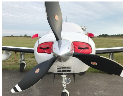
Piper PA-46-350P Mirage, Matrix, JetProp Engine Inlet Plugs