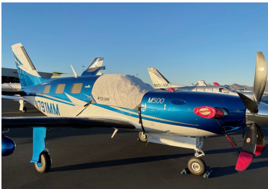
Piper M500 Cockpit Cover

This cover type is made from Silver Acrylic Sunbrella canvas and is 100% lined with a soft and smooth microfiber. Bruce's Custom Covers developed this material combination especially for aircraft protection. The outer material is medium weight and treated for water resistance, UV resistance and anti-static buildup. The inner lining is a very soft and smooth microfiber to prevent scratching. The material is very reflective, and tests show that the cabin interior temperature can be reduced to near-ambient temperature on the hottest of days. It is water, ice and snow repellent, yet breathable to allow moisture to escape from between the cover and the aircraft surface.