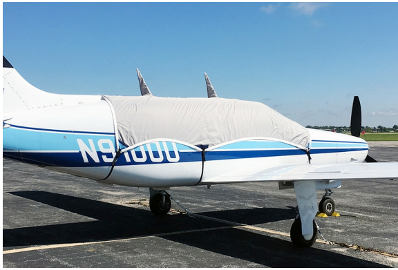
Piper PA-46 Malibu Travel Cover