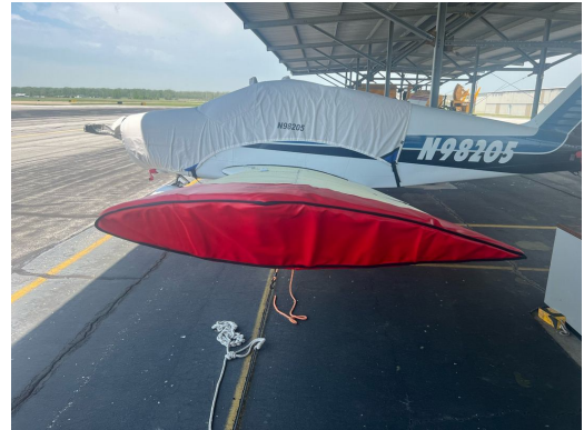
Piper PA-28-140 Wingtip Pads