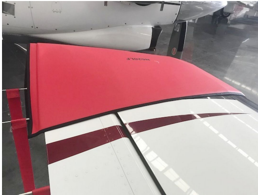
Piper Meridian Wingtip Pads, M600 Models

Designed to prevent damage to the aircraft extremities in crowded hangars, these products are made of bright red Naugahyde and thickly padded with a sandwich of closed cell foam.