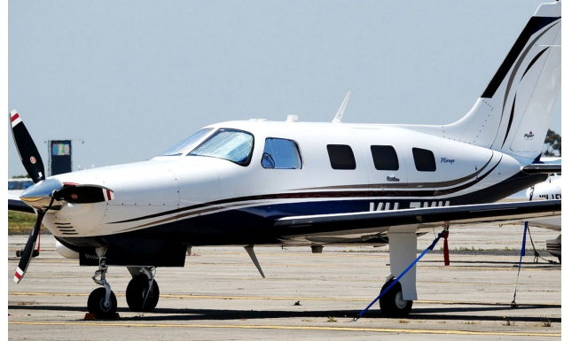
Piper PA-46-350P Mirage, Matrix, JetProp Cockpit Heatshields