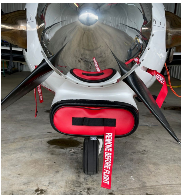
Piper Malibu JetProp Inlet Plugs

This cover type is made from Silver Acrylic Sunbrella canvas and is 100% lined with a soft and smooth microfiber. Bruce's Custom Covers developed this material combination especially for aircraft protection. The outer material is medium weight and treated for water resistance, UV resistance and anti-static buildup. The inner lining is a very soft and smooth microfiber to prevent scratching. The material is very reflective, and tests show that the cabin interior temperature can be reduced to near-ambient temperature on the hottest of days. It is water, ice and snow repellent, yet breathable to allow moisture to escape from between the cover and the aircraft surface.