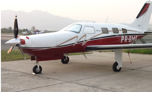
Piper Malibu/Mirage Engine Plugs, Cockpit HeatShields

Heatshields are interior sunshades for an aircraft's windows or canopy glass. The product is a unique composite of closed-cell foam with a silver mylar finish. The semi-rigid design is stiff enough to stand along the inside of the windshield using sun visors or window framing. It folds up flat and easily stores in the included storage sleeve. Some designs may require velcro and suction cups. A Heatshield is an excellent short-term remedy for cockpit overheating.