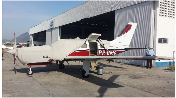
Piper Malibu/Mirage Extended Canopy Cover, Engine, Prop & Wing Covers