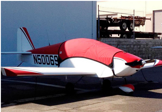
SPA, Sport Performance Aviation, Panther Canopy Cover (test fit cover)