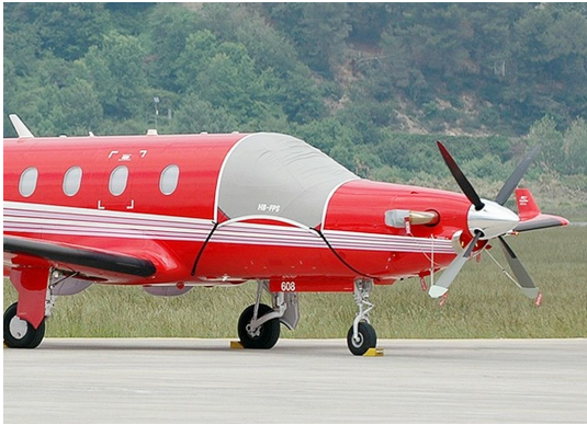
Pilatus PC-12 Windshield Cover