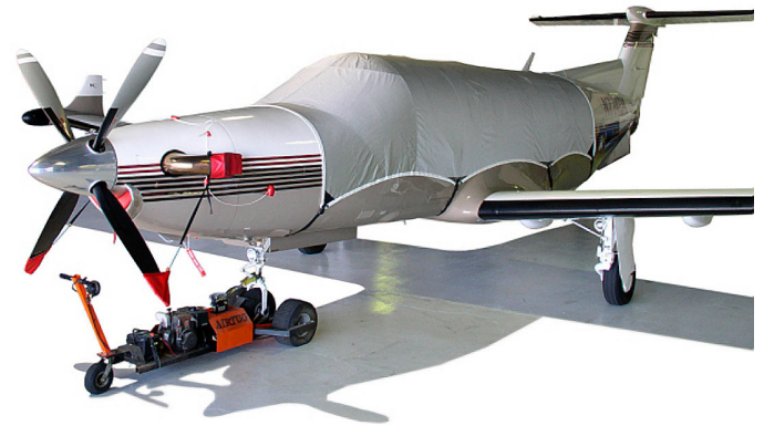
PC-12 Canopy Cover, Engine Plugs, Prop Tie/Exhaust Covers