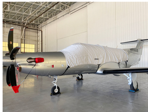
PC-12 Canopy Cover, Engine Plugs, Prop Tie/Exhaust Covers