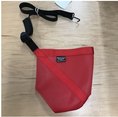
Prop Tie-Down, Various Models (secures with a hook to engine nacelle)

This cover type is made from Silver Acrylic Sunbrella canvas and is 100% lined with a soft and smooth microfiber. Bruce's Custom Covers developed this material combination especially for aircraft protection. The outer material is medium weight and treated for water resistance, UV resistance and anti-static buildup. The inner lining is a very soft and smooth microfiber to prevent scratching. The material is very reflective, and tests show that the cabin interior temperature can be reduced to near-ambient temperature on the hottest of days. It is water, ice and snow repellent, yet breathable to allow moisture to escape from between the cover and the aircraft surface.