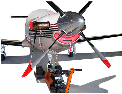
Pilatus PC-12 LARGE ENGINE INLET PLUG, SMALL PLUGS SET, Prop Tie/Exhaust Covers