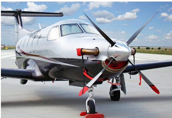
Pilatus PC-12 Engine Plugs, Prop Ties, Cockpit HeatShields

Engine Inlet Plugs are custom fit for your Pilatus PC-12, U-28A, NGX intakes, made with heavy-duty vinyl material, and stuffed with a single block of sculpted urethane foam. Each plug has a zipper that allows the foam to be removed and dried if necessary. Engine plugs have warning flags that are visible from the cockpit or 'remove before flight' streamers sewn onto the face of the plugs. Most plugs are imprinted with the aircraft registration number in black for an extra charge. Storage bag NOT included. Engine plugs may be inserted after flight when the engine is still warm. Engine Inlet Plugs are commonly referred to as Cowl Plugs, Intake Plugs, Cowl Blocks, Engine Blocks, and Engine Bungs.