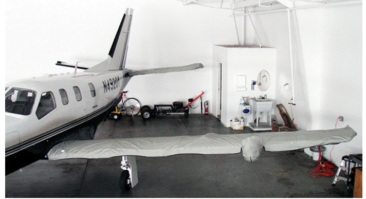
Pilatus PC-12 Wing Covers