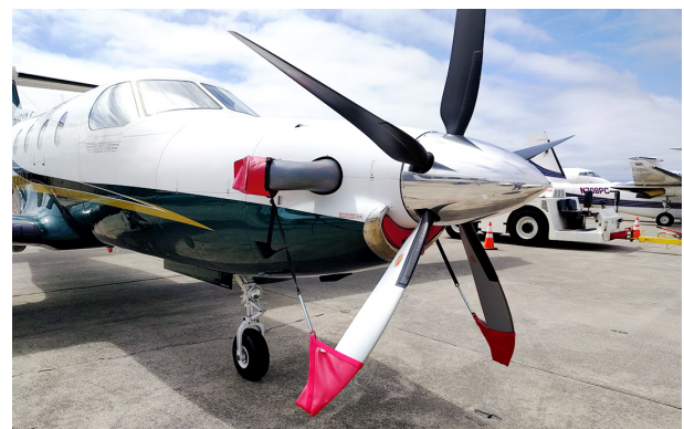
PC-12 Canopy Cover, Engine Plugs, Prop Tie/Exhaust Covers Main Intake Plug and Prop-Tie/Exhaust Covers. (Sold Separately)