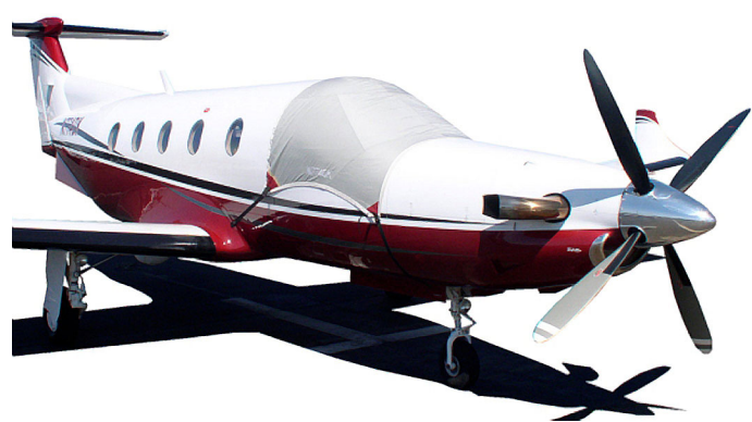
PC-12 Windshield Cover

This cover type is made from Silver Acrylic Sunbrella canvas and is 100% lined with a soft and smooth microfiber. Bruce's Custom Covers developed this material combination especially for aircraft protection. The outer material is medium weight and treated for water resistance, UV resistance and anti-static buildup. The inner lining is a very soft and smooth microfiber to prevent scratching. The material is very reflective, and tests show that the cabin interior temperature can be reduced to near-ambient temperature on the hottest of days. It is water, ice and snow repellent, yet breathable to allow moisture to escape from between the cover and the aircraft surface.