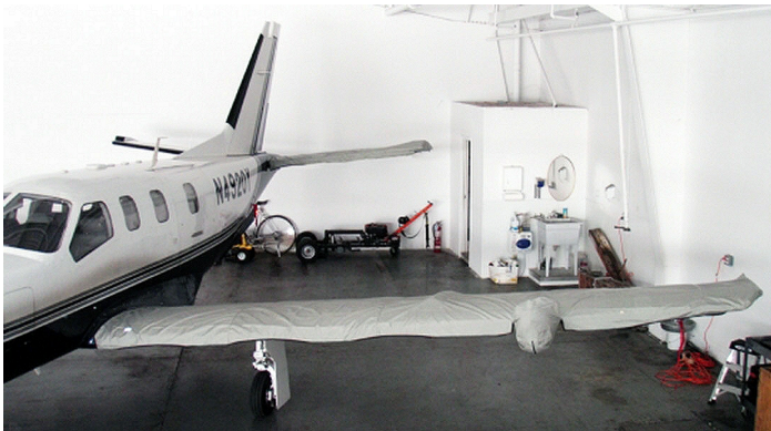
Pilatus PC-12 Wing Covers

WINTER USE MATERIAL - Made with Solution-Dyed Polyester fabric, this option is intended for seasonal use to aid in deicing, rain mitigation, or for occasional travel. The material is lighter and more compact, but more susceptible to UV damage and may have a shorter useful life if used continuously outside than the all-year use material.