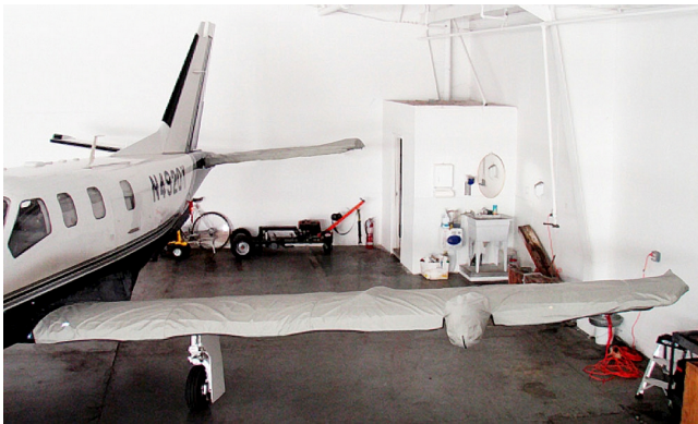
Socata TBM 700, 850 Wing and Horizontal Stabilizer Covers