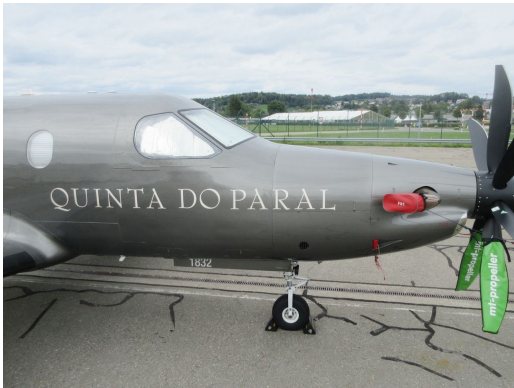
Pilatus PC-12 Cockpit HeatShields

Cockpit Heatshields are interior sunshades for the aircraft's cockpit. The product is a unique composite of closed-cell foam with a silver mylar finish. The semi-rigid design is stiff enough to stand inside the window framing. The set folds up flat and is easily stored in the included storage sleeve. Some designs may require velcro and suction cups. A Heatshield is an excellent short-term remedy for cockpit overheating, but an external fabric cover is more effective for long-term protection.