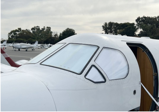
Pilatus PC-12 Cockpit HeatShields

Cockpit Heatshields are interior sunshades for the aircraft's cockpit. The product is a unique composite of closed-cell foam with a silver mylar finish. The semi-rigid design is stiff enough to stand inside the window framing. The set folds up flat and is easily stored in the included storage sleeve. Some designs may require velcro and suction cups. A Heatshield is an excellent short-term remedy for cockpit overheating, but an external fabric cover is more effective for long-term protection.