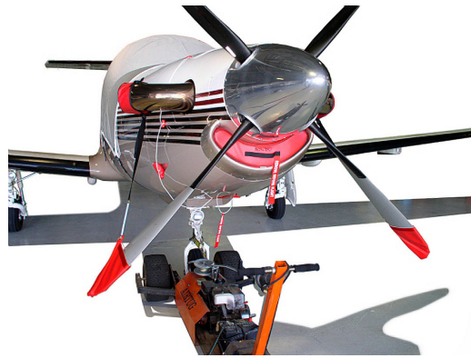
Pilatus PC-12 LARGE ENGINE INLET PLUG, SMALL PLUGS SET, Prop Tie/Exhaust Covers