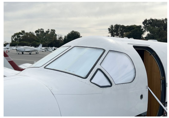
Pilatus PC-12 Cockpit HeatShields