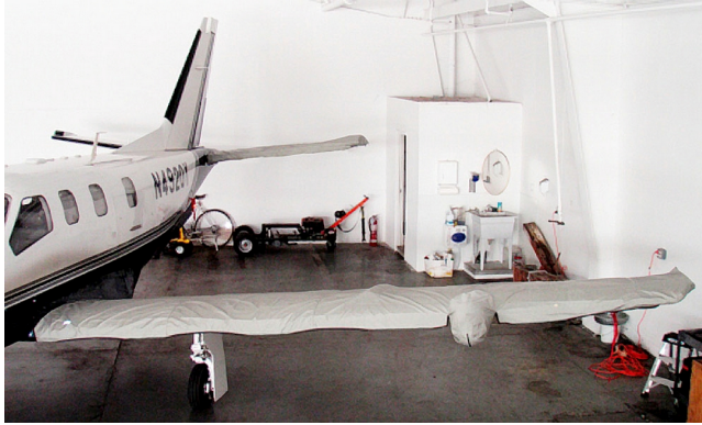
Socata TBM 700, 850 Wing and Horizontal Stabilizer Covers

WINTER USE MATERIAL - Made with Solution-Dyed Polyester fabric, this option is intended for seasonal use to aid in deicing, rain mitigation, or for occasional travel. The material is lighter and more compact, but more susceptible to UV damage and may have a shorter useful life if used continuously outside than the all-year use material.