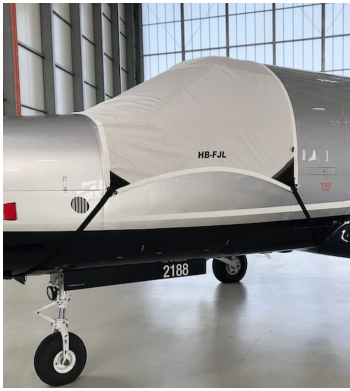
Pilatus PC-12 Cockpit Cover