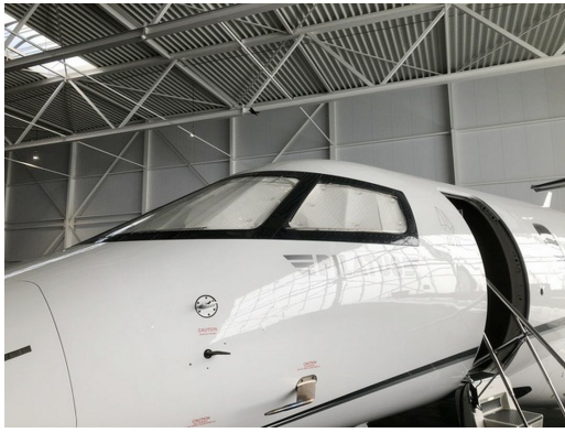
Pilatus PC-24 Cockpit HeatShields