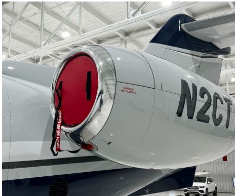
Pilatus PC-24 Engine Inlet Plugs

The Engine Inlet Plugs are custom fit for your Pilatus PC-24 intakes, made with heavy-duty vinyl material, and stuffed with a single block of sculpted urethane foam. Each plug has a zipper that allows the foam to be removed and dried if necessary. Engine plugs have 'remove before flight' streamers sewn onto the face of the plugs. Most plugs are imprinted with the aircraft registration number in black for an extra charge. Storage bag NOT included. Engine plugs may be inserted after flight when the engine is still warm. Engine Inlet Plugs are commonly referred to as Cowl Plugs, Intake Plugs, Cowl Blocks, Engine Blocks, and Engine Bungs.