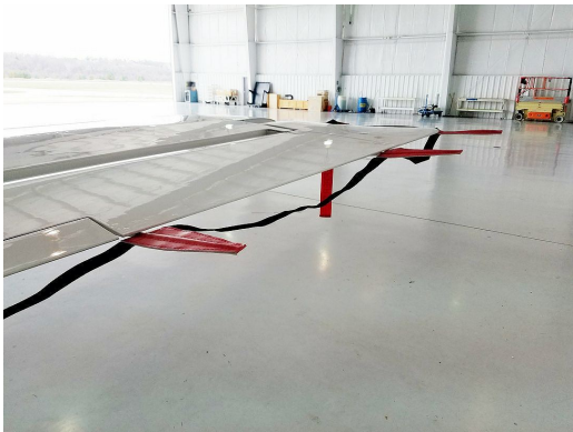
Hawker Beechcraft 800, 800XP, 850XP Static Wick Protectors