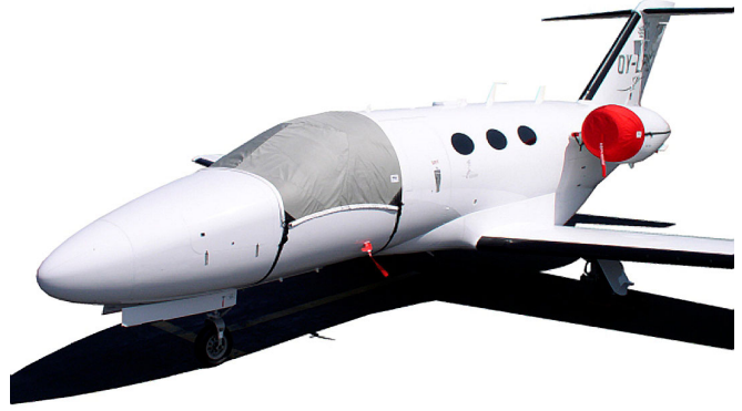
Citation Mustang Windshield Cover, Intake Cover/Exhaust Plug Set, Pitot Covers