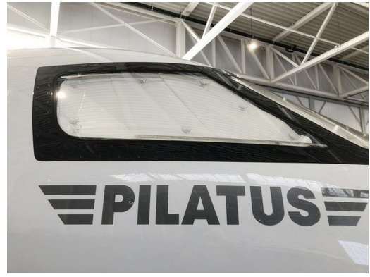
Pilatus PC-24 Cockpit HeatShields