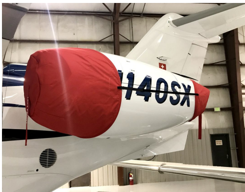
Pilatus PC-24 Engine Cover Set, Tri-Fold Type

The Pilatus PC-24 Intake/Exhaust Plugs are custom fit for the intake and exhaust openings, made with heavy-duty vinyl material, and stuffed with a single block of sculpted urethane foam. Each plug has a zipper that allows the foam to be removed and dried if necessary. Engine plugs have 'remove before flight' streamers sewn onto the face of the plugs. Most plugs are imprinted with the aircraft registration number in black. Engine plugs may be inserted after flight when the engine is still warm. Engine Inlet Plugs are commonly referred to as Cowl Plugs, Intake Plugs, Cowl Blocks, Engine Blocks, and Engine Bungs.