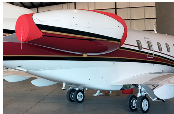
Intake/Exhaust Covers, 3-Strap Type. Successfully installed by two crew, one ladder.