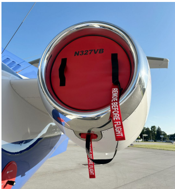
Pilatus PC-24 Engine Inlet Plugs & Exhaust Plugs, With Starter Inlet Plugs

The Engine Inlet Plugs are custom fit for your Pilatus PC-24 intakes, made with heavy-duty vinyl material, and stuffed with a single block of sculpted urethane foam. Each plug has a zipper that allows the foam to be removed and dried if necessary. Engine plugs have 'remove before flight' streamers sewn onto the face of the plugs. Most plugs are imprinted with the aircraft registration number in black for an extra charge. Storage bag NOT included. Engine plugs may be inserted after flight when the engine is still warm. Engine Inlet Plugs are commonly referred to as Cowl Plugs, Intake Plugs, Cowl Blocks, Engine Blocks, and Engine Bungs.