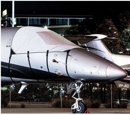
Pilatus PC-24 Cockpit Cover