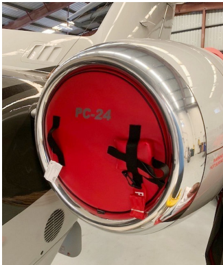
Pilatus PC-24 Engine Intake Plug

The Engine Inlet Plugs are custom fit for your Pilatus PC-24 intakes, made with heavy-duty vinyl material, and stuffed with a single block of sculpted urethane foam. Each plug has a zipper that allows the foam to be removed and dried if necessary. Engine plugs have 'remove before flight' streamers sewn onto the face of the plugs. Most plugs are imprinted with the aircraft registration number in black for an extra charge. Storage bag NOT included. Engine plugs may be inserted after flight when the engine is still warm. Engine Inlet Plugs are commonly referred to as Cowl Plugs, Intake Plugs, Cowl Blocks, Engine Blocks, and Engine Bungs.