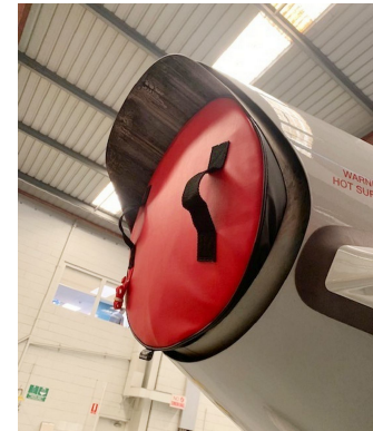
Pilatus PC-24 Engine Exhaust Plug