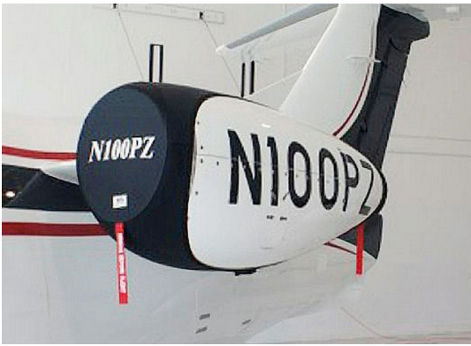
Phenom 100 "Bikini" Engine Covers