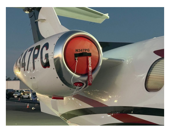
Embraer Phenom 100 Intake & Exhaust Plugs