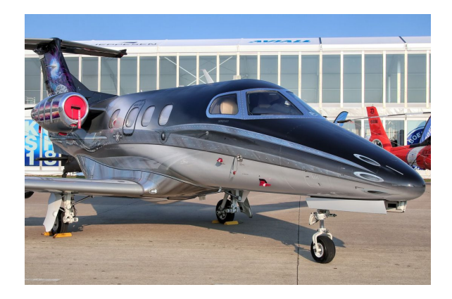
Phenom 100 Engine Inlet Plugs

The Engine Inlet Plugs are custom fit for your Embraer Phenom 100 (EMB-500) intakes, made with heavy-duty vinyl material, and stuffed with a single block of sculpted urethane foam. Each plug has a zipper that allows the foam to be removed and dried if necessary. Engine plugs have 'remove before flight' streamers sewn onto the face of the plugs. Most plugs are imprinted with the aircraft registration number in black for an extra charge. Storage bag NOT included. Engine plugs may be inserted after flight when the engine is still warm. Engine Inlet Plugs are commonly referred to as Cowl Plugs, Intake Plugs, Cowl Blocks, Engine Blocks, and Engine Bungs.