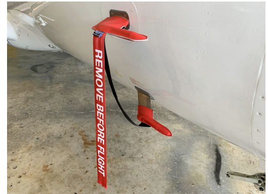
Embraer Phenom 300 Pitot Covers