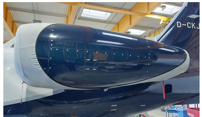
Phenom 300 Bikini Type Engine Cover