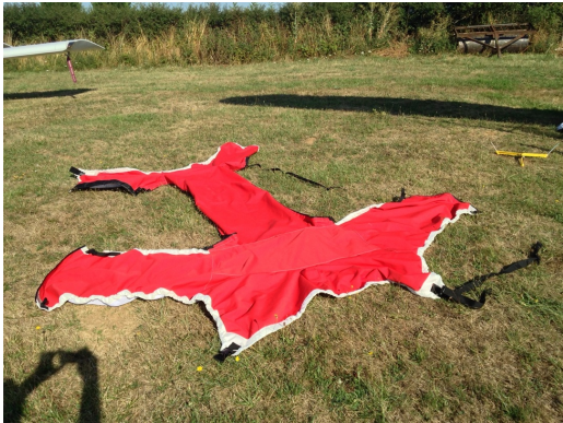
Porterfield Collegiate Canopy Cover