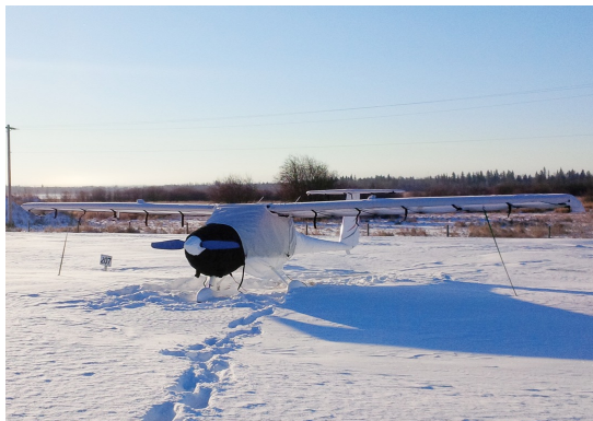
Pipistrel Canopy, Wings, Tail & Insulated Engine Covers

This cover type is made from Silver Acrylic Sunbrella canvas and is 100% lined with a soft and smooth microfiber. Bruce's Custom Covers developed this material combination especially for aircraft protection. The outer material is medium weight and treated for water resistance, UV resistance and anti-static buildup. The inner lining is a very soft and smooth microfiber to prevent scratching. The material is very reflective, and tests show that the cabin interior temperature can be reduced to near-ambient temperature on the hottest of days. It is water, ice and snow repellent, yet breathable to allow moisture to escape from between the cover and the aircraft surface.