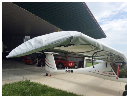
Pipistrel Virus Wing & Horizontal Stab. Covers