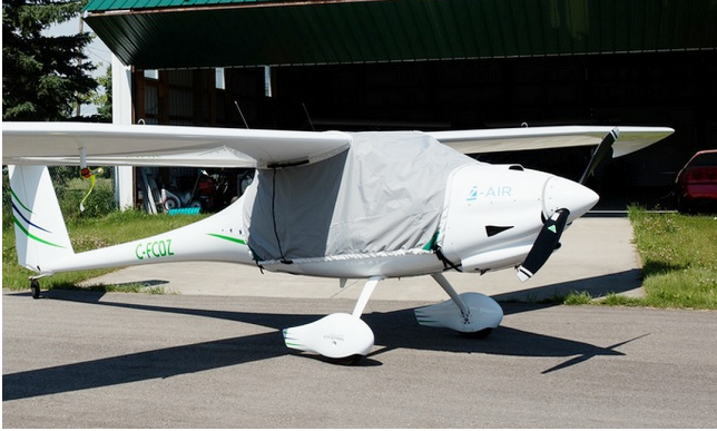
Pipistrel Light Weight Travel Canopy Cover

Travel Covers are made with Silver Solution-Dyed Polyester fabric and only lined over the windshield to save weight. The material is lightweight and more compact for easy stowage in the aircraft. The polyester material is water resistant, but only intended for occasional use outside. We also have an ultra lightweight material available for fitted hangar dust covers. For daily outdoor use, the non-travel Sunbrella Cover is the best choice.