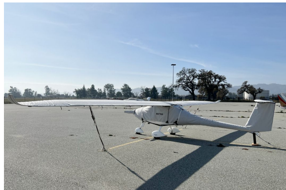
Pipistrel Sinus LSA Full Cover Set