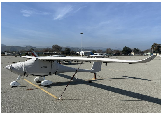
Pipistrel Sinus LSA Full Cover Set

WINTER USE MATERIAL - Made with Solution-Dyed Polyester fabric, this option is intended for seasonal use to aid in deicing, rain mitigation, or for occasional travel. The material is lighter and more compact, but more susceptible to UV damage and may have a shorter useful life if used continuously outside than the all-year use material.