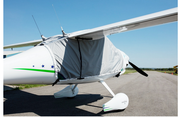
Pipistrel Light Weight Travel Canopy Cover