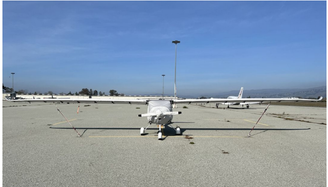
Pipistrel Sinus LSA Full Cover Set