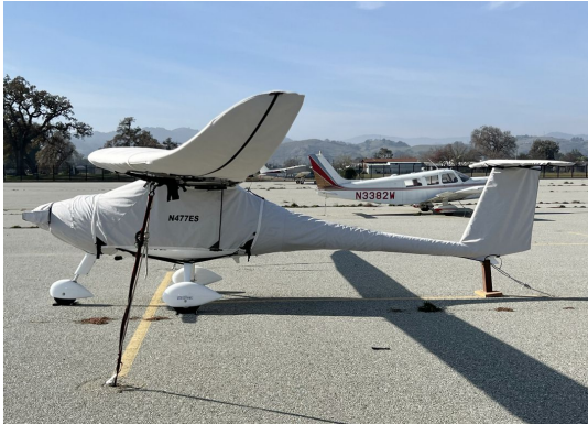
Pipistrel Sinus LSA Full Cover Set

This cover type is made from Silver Acrylic Sunbrella canvas and is 100% lined with a soft and smooth microfiber. Bruce's Custom Covers developed this material combination especially for aircraft protection. The outer material is medium weight and treated for water resistance, UV resistance and anti-static buildup. The inner lining is a very soft and smooth microfiber to prevent scratching. The material is very reflective, and tests show that the cabin interior temperature can be reduced to near-ambient temperature on the hottest of days. It is water, ice and snow repellent, yet breathable to allow moisture to escape from between the cover and the aircraft surface.