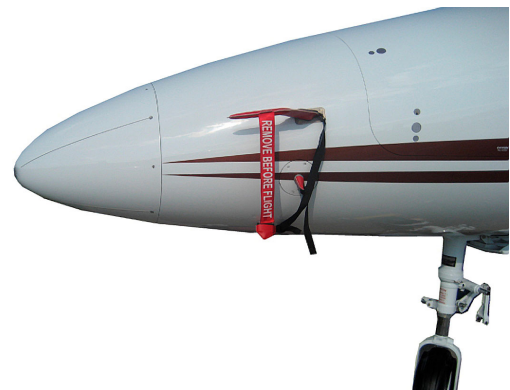
Premier Pitot, AOA, Rosemount Cover Set