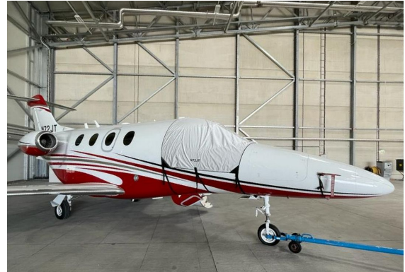
Hawker Premier Cockpit Cover