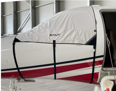
Hawker Premier Cockpit Cover

This cover type is made from Silver Acrylic Sunbrella canvas and is 100% lined with a soft and smooth microfiber. Bruce's Custom Covers developed this material combination especially for aircraft protection. The outer material is medium weight and treated for water resistance, UV resistance and anti-static buildup. The inner lining is a very soft and smooth microfiber to prevent scratching. The material is very reflective, and tests show that the cabin interior temperature can be reduced to near-ambient temperature on the hottest of days. It is water, ice and snow repellent, yet breathable to allow moisture to escape from between the cover and the aircraft surface.