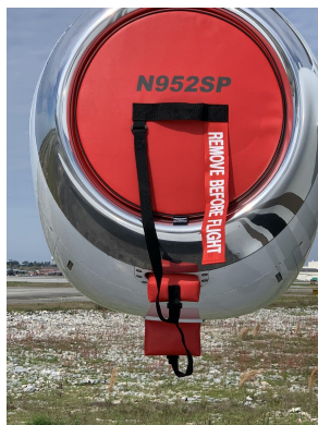
Beech Premier 1A Intake/Exhaust Plug Set

The Hawker Beechcraft Premier 390 Intake/Exhaust Plugs are custom fit for the intake and exhaust openings, made with heavy-duty vinyl material, and stuffed with a single block of sculpted urethane foam. Each plug has a zipper that allows the foam to be removed and dried if necessary. Engine plugs have 'remove before flight' streamers sewn onto the face of the plugs. Most plugs are imprinted with the aircraft registration number in black. Engine plugs may be inserted after flight when the engine is still warm. Engine Inlet Plugs are commonly referred to as Cowl Plugs, Intake Plugs, Cowl Blocks, Engine Blocks, and Engine Bungs.