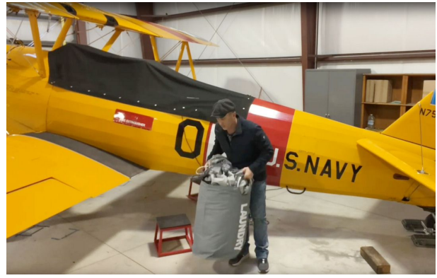
#1: Out of the bag.