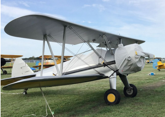
Stearman Trainer A75 Engine Cover (Continental Engine)

This cover type is made from Silver Acrylic Sunbrella canvas and is 100% lined with a soft and smooth microfiber. Bruce's Custom Covers developed this material combination especially for aircraft protection. The outer material is medium weight and treated for water resistance, UV resistance and anti-static buildup. The inner lining is a very soft and smooth microfiber to prevent scratching. The material is very reflective, and tests show that the cabin interior temperature can be reduced to near-ambient temperature on the hottest of days. It is water, ice and snow repellent, yet breathable to allow moisture to escape from between the cover and the aircraft surface.