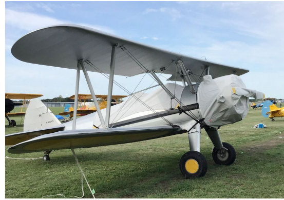
Stearman Trainer A75 Engine Cover (Continental Engine)