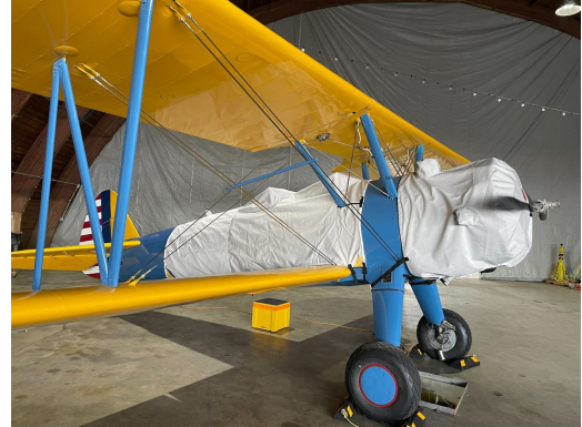
Boeing Stearman Extended Canopy Cover, Engine Cover