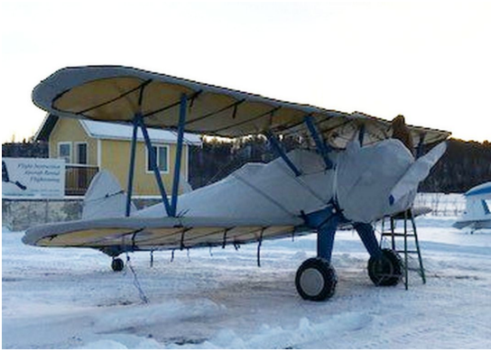
Boeing Stearman PT-13 Winter Cover Set

the hottest of days. It is water, ice and snow repellent, yet breathable to allow moisture to escape from between the cover and the aircraft surface.