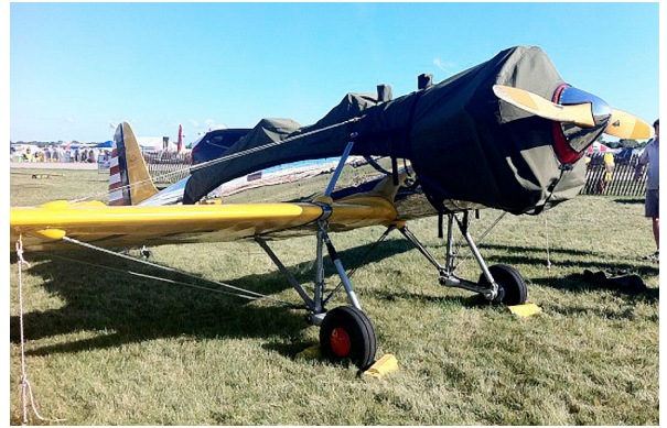
Ryan PT-22 Canopy Cover and Engine Cover