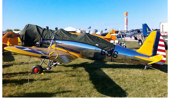
Ryan PT-22 ST3KR Canopy Cover and Engine Cover