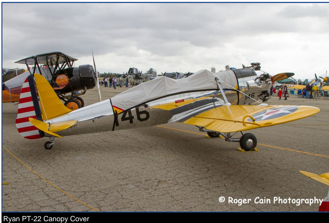
Ryan PT-22 Canopy Cover