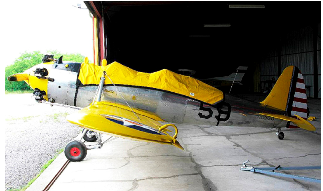
Ryan PT-22 Canopy Cover