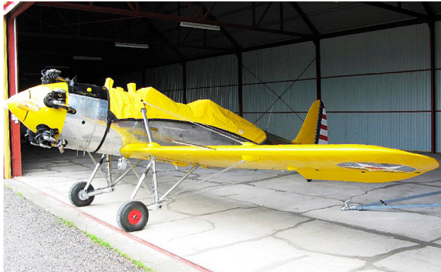
Ryan PT22 Canopy Cover

This cover type is made from Silver Acrylic Sunbrella canvas and is 100% lined with a soft and smooth microfiber. Bruce's Custom Covers developed this material combination especially for aircraft protection. The outer material is medium weight and treated for water resistance, UV resistance and anti-static buildup. The inner lining is a very soft and smooth microfiber to prevent scratching. The material is very reflective, and tests show that the cabin interior temperature can be reduced to near-ambient temperature on the hottest of days. It is water, ice and snow repellent, yet breathable to allow moisture to escape from between the cover and the aircraft surface.