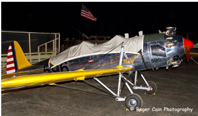
Ryan PT-22 Canopy Cover

Travel Covers are made with Silver Solution-Dyed Polyester fabric and only lined over the windshield to save weight. The material is lightweight and more compact for easy stowage in the aircraft. The polyester material is water resistant, but only intended for occasional use outside. We also have an ultra lightweight material available for fitted hangar dust covers. For daily outdoor use, the non-travel Sunbrella Cover is the best choice.