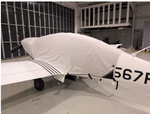
Pipistrel Panthera Extended Canopy/Engine Cover

This cover type is made from Silver Acrylic Sunbrella canvas and is 100% lined with a soft and smooth microfiber. Bruce's Custom Covers developed this material combination especially for aircraft protection. The outer material is medium weight and treated for water resistance, UV resistance and anti-static buildup. The inner lining is a very soft and smooth microfiber to prevent scratching. The material is very reflective, and tests show that the cabin interior temperature can be reduced to near-ambient temperature on the hottest of days. It is water, ice and snow repellent, yet breathable to allow moisture to escape from between the cover and the aircraft surface.