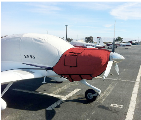
Diamond DA-40 Insulated Engine Cover, Red