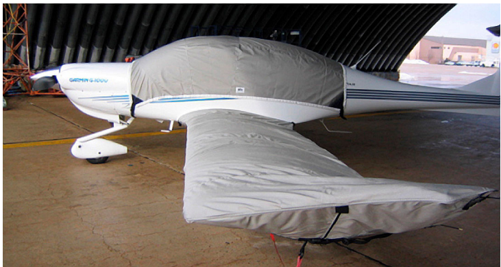
Diamond DA-40 Canopy & Wing Covers