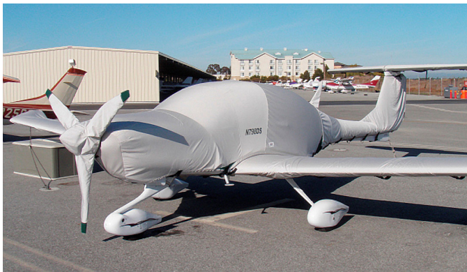
Diamond DA-40 Full Cover Set

This cover type is made from Silver Acrylic Sunbrella canvas and is 100% lined with a soft and smooth microfiber. Bruce's Custom Covers developed this material combination especially for aircraft protection. The outer material is medium weight and treated for water resistance, UV resistance and anti-static buildup. The inner lining is a very soft and smooth microfiber to prevent scratching. The material is very reflective, and tests show that the cabin interior temperature can be reduced to near-ambient temperature on the hottest of days. It is water, ice and snow repellent, yet breathable to allow moisture to escape from between the cover and the aircraft surface.