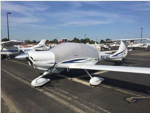
Diamond DA-40 Travel Cover, Light Weight Travel Canopy Cover