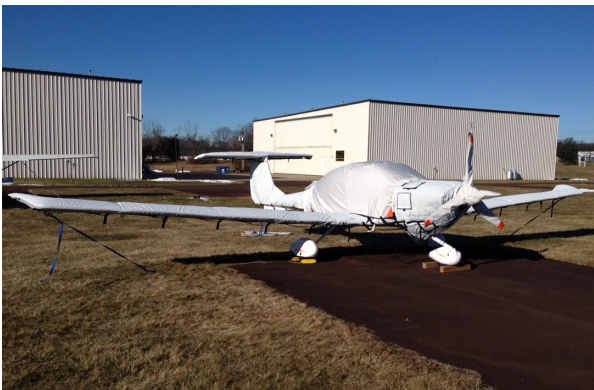
Diamond DA-40 Full Cover Set, with Insulated Engine Cover