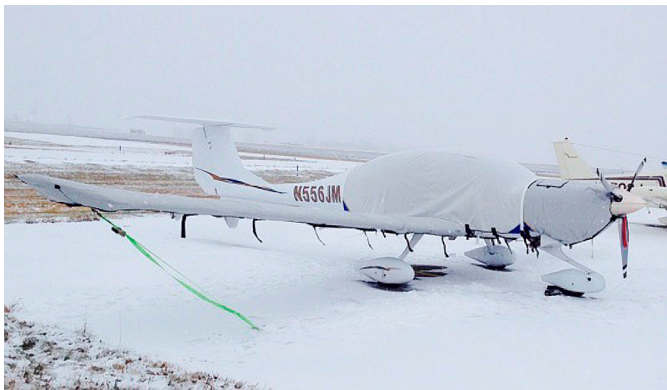
Diamond DA-40 Extended Canopy Cover, Wing Covers & Insulated Engine Cover

WINTER USE MATERIAL - Made with Solution-Dyed Polyester fabric, this option is intended for seasonal use to aid in deicing, rain mitigation, or for occasional travel. The material is lighter and more compact, but more susceptible to UV damage and may have a shorter useful life if used continuously outside than the all-year use material.