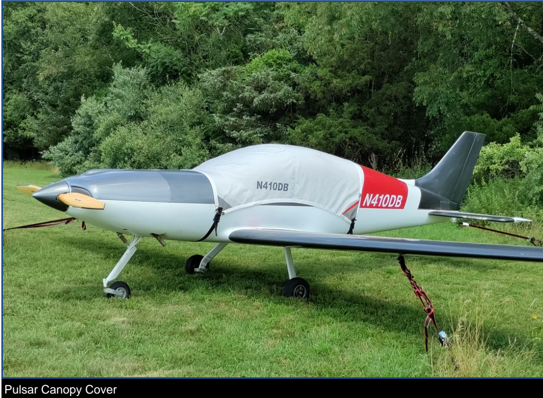
Pulsar Canopy Cover