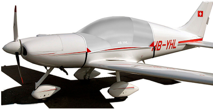
Pulsar Canopy Cover (illustration)

This cover type is made from Silver Acrylic Sunbrella canvas and is 100% lined with a soft and smooth microfiber. Bruce's Custom Covers developed this material combination especially for aircraft protection. The outer material is medium weight and treated for water resistance, UV resistance and anti-static buildup. The inner lining is a very soft and smooth microfiber to prevent scratching. The material is very reflective, and tests show that the cabin interior temperature can be reduced to near-ambient temperature on the hottest of days. It is water, ice and snow repellent, yet breathable to allow moisture to escape from between the cover and the aircraft surface.