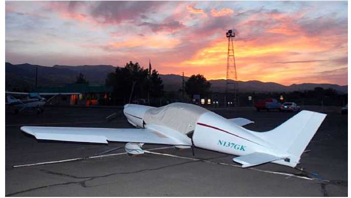
Pulsar Canopy Cover