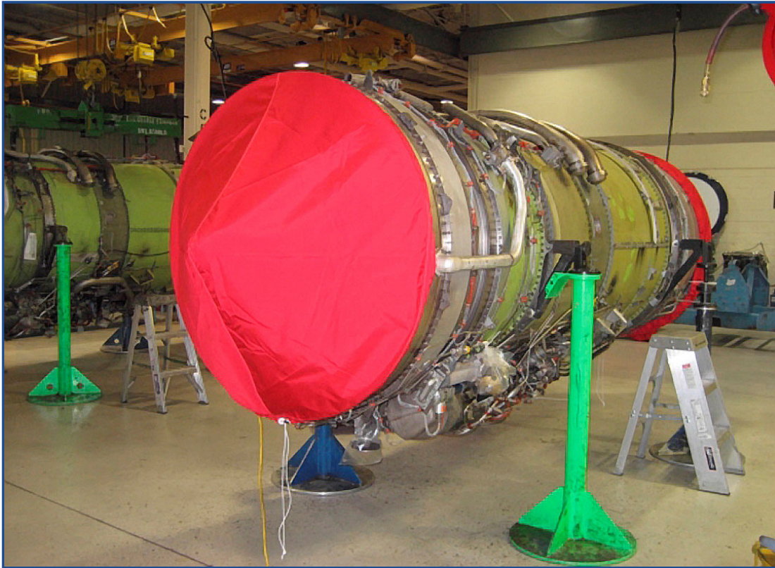
PW JT8D Off-Link Engine Shower Cap Cover Set