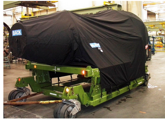
PW4077 Maintenance Exhaust ShowerCap, P/N: PW-119 PW 2000 Series OFF-LINK ENGINE STORAGE COVER, Rain Cap