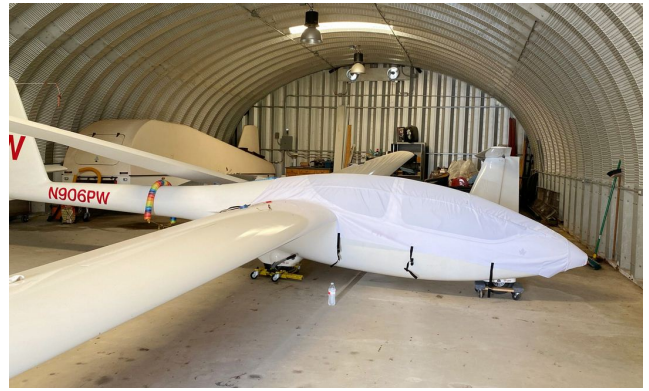
PZL Swidnik PW6 Canopy/Nose Cover