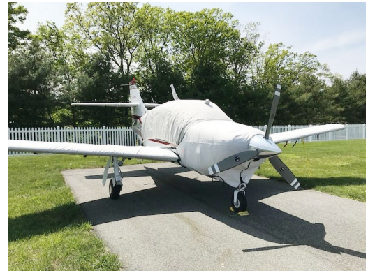
Rockwell Commander 114A Canopy, Engine, Wings & Horizontal Stab. Covers