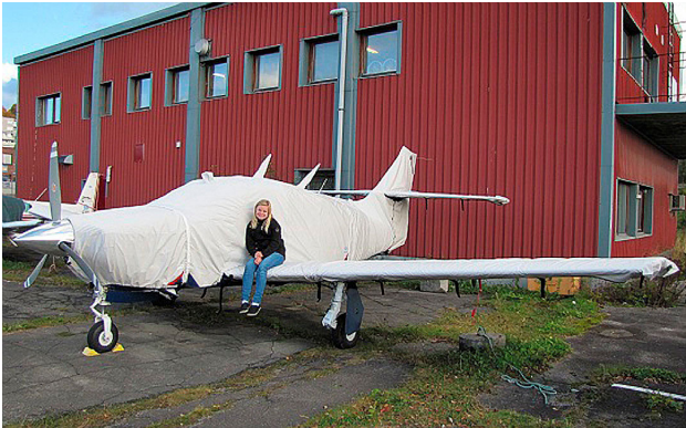
Rockwell Commander Engine, Extended Canopy, Wings, & Empennage Covers

This cover type is made from Silver Acrylic Sunbrella canvas and is 100% lined with a soft and smooth microfiber. Bruce's Custom Covers developed this material combination especially for aircraft protection. The outer material is medium weight and treated for water resistance, UV resistance and anti-static buildup. The inner lining is a very soft and smooth microfiber to prevent scratching. The material is very reflective, and tests show that the cabin interior temperature can be reduced to near-ambient temperature on the hottest of days. It is water, ice and snow repellent, yet breathable to allow moisture to escape from between the cover and the aircraft surface.