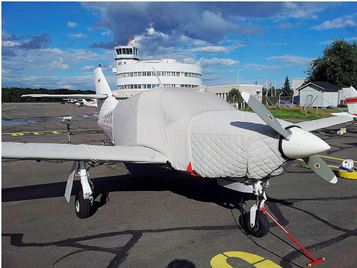
Rockwell Commander 114 Extended Canopy, Insulated Engine, Wing Covers