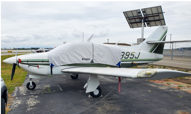
Rockwell International 112A Canopy Cover