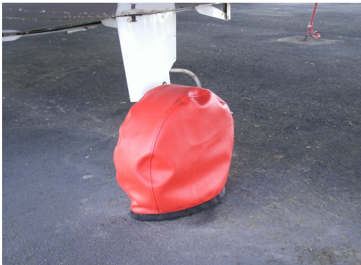
Piper PA28-140 Tire Covers