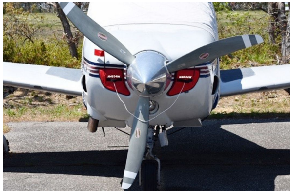
Rockwell 114 Engine Plugs