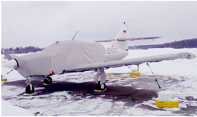
Rockwell Commander Extended Canopy Cover, Insulated Engine Cover, Wing & Tail Covers