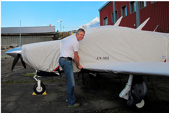
Rockwell Commander 114 Full Cover Set

This cover type is made from Silver Acrylic Sunbrella canvas and is 100% lined with a soft and smooth microfiber. Bruce's Custom Covers developed this material combination especially for aircraft protection. The outer material is medium weight and treated for water resistance, UV resistance and anti-static buildup. The inner lining is a very soft and smooth microfiber to prevent scratching. The material is very reflective, and tests show that the cabin interior temperature can be reduced to near-ambient temperature on the hottest of days. It is water, ice and snow repellent, yet breathable to allow moisture to escape from between the cover and the aircraft surface.