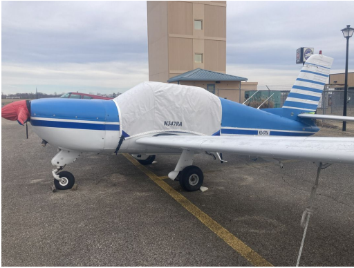
SOCATA Rallye 150 Canopy Cover, Prop Cover

The Aerospatiale (Socata) Rallye 150 Canopy/Engine Cover is a one-piece cover (100% lined with microfiber) that is a combination of the Canopy Cover and Engine Cover. This cover will enclose the engine cowl and will extend aft to cover all of the windows. This cover type is made from Silver Acrylic Sunbrella canvas and is 100% lined with a soft and smooth microfiber. Bruce's Custom Covers developed this material combination especially for aircraft protection. The outer material is medium weight and treated for water resistance, UV resistance and anti-static buildup. The inner lining is a very soft and smooth microfiber to prevent scratching. The material is very reflective, and tests show that the cabin interior temperature can be reduced to near-ambient temperature on the hottest of days. It is water, ice and snow repellent, yet breathable to allow moisture to escape from between the cover and the aircraft surface.