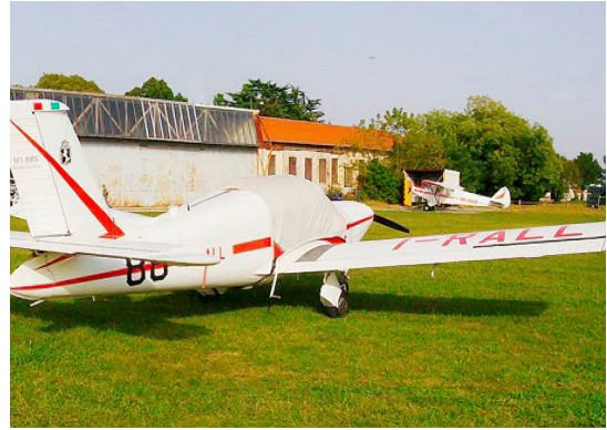
Standard Canopy Cover for MS893A