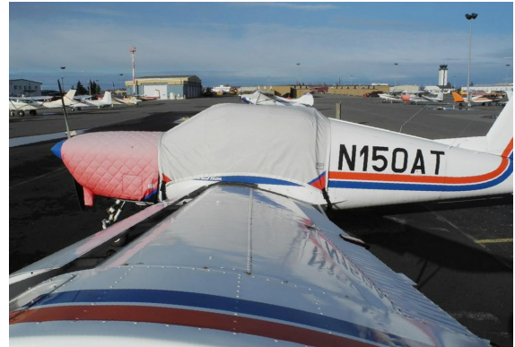
Koliber 150A Canopy Cover, Insulated Engine Cover