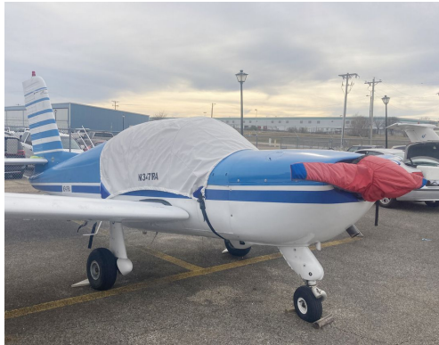
SOCATA Rallye 150 Canopy Cover, Prop Cover

This cover type is made from Silver Acrylic Sunbrella canvas and is 100% lined with a soft and smooth microfiber. Bruce's Custom Covers developed this material combination especially for aircraft protection. The outer material is medium weight and treated for water resistance, UV resistance and anti-static buildup. The inner lining is a very soft and smooth microfiber to prevent scratching. The material is very reflective, and tests show that the cabin interior temperature can be reduced to near-ambient temperature on the hottest of days. It is water, ice and snow repellent, yet breathable to allow moisture to escape from between the cover and the aircraft surface.