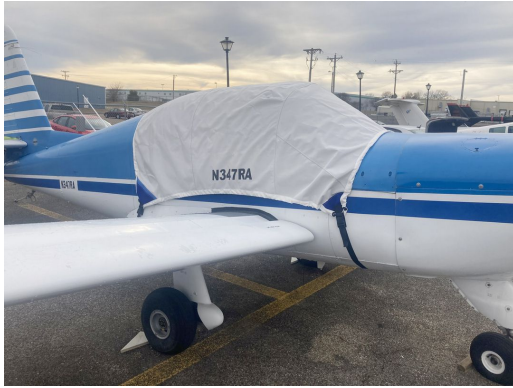
SOCATA Rallye 150 Canopy Cover

The Aerospatiale (Socata) Rallye 150 Canopy/Engine Cover is a one-piece cover (100% lined with microfiber) that is a combination of the Canopy Cover and Engine Cover. This cover will enclose the engine cowl and will extend aft to cover all of the windows. This cover type is made from Silver Acrylic Sunbrella canvas and is 100% lined with a soft and smooth microfiber. Bruce's Custom Covers developed this material combination especially for aircraft protection. The outer material is medium weight and treated for water resistance, UV resistance and anti-static buildup. The inner lining is a very soft and smooth microfiber to prevent scratching. The material is very reflective, and tests show that the cabin interior temperature can be reduced to near-ambient temperature on the hottest of days. It is water, ice and snow repellent, yet breathable to allow moisture to escape from between the cover and the aircraft surface.