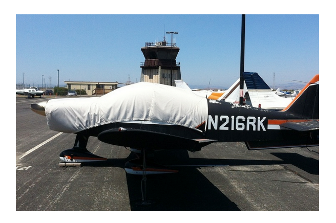
Robin Canopy/Engine Cover