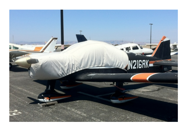
Robin Canopy/Engine Cover