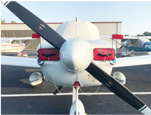
Grumman AA-5A Engine Inlet Plugs, Traveler models w/carb inlet plug (set of 3) on a

Engine Inlet Plugs are custom fit for your Robin 3140 & R-3000 intakes, made with heavy-duty vinyl material, and stuffed with a single block of sculpted urethane foam. Each plug has a zipper that allows the foam to be removed and dried if necessary. Engine plugs have warning flags that are visible from the cockpit or 'remove before flight' streamers sewn onto the face of the plugs. Most plugs are imprinted with the aircraft registration number in black for an extra charge. Storage bag NOT included. Engine plugs may be inserted after flight when the engine is still warm. Engine Inlet Plugs are commonly referred to as Cowl Plugs, Intake Plugs, Cowl Blocks, Engine Blocks, and Engine Bungs.