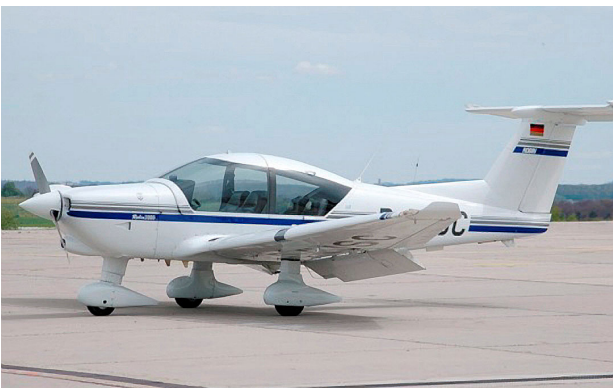
Canopy Cover for the Robin 3140 & R-3000