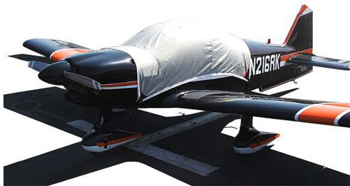
Robin R.2160 Canopy Cover