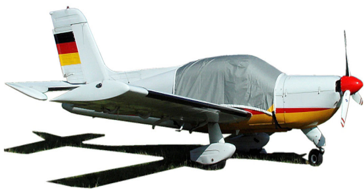
Rallye 150 Canopy Cover

the hottest of days. It is water, ice and snow repellent, yet breathable to allow moisture to escape from between the cover and the aircraft surface.