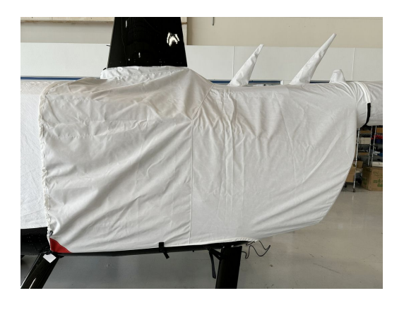
Robinson R-66 Engine Cover