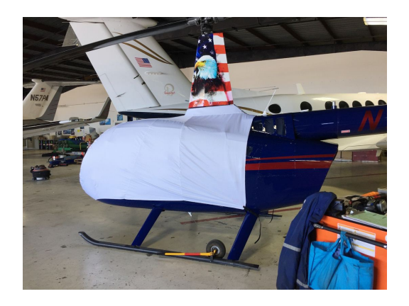
Robinson R-66 Extended Bubble Cover, past rotor mast.