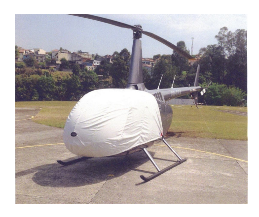
Robinson R-66 Bubble Cover