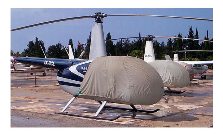
Robinson R-44 Bubble Covers