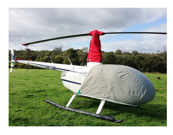
Robinson R-44 Bubble, Rotor Hub, Tail Rotor Covers, & Blade Tie-Downs