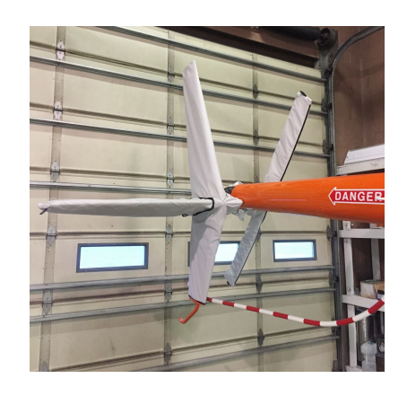
Robinson R-44 Tail Fins and Tail Rotor Covers

The Tailboom Cover details vary by model, but generally the helicopter tail boom cover encloses the tail boom from the "bottleneck" to the aft end. They usually also cover the horizontal stabilizers, and are custom made to allow for antennae, lights, and other protrusions. They attach with straps underneath the tail boom. Covers for the vertical and horizontal stabilizers are also available separately. Specific information for each model is available on request.