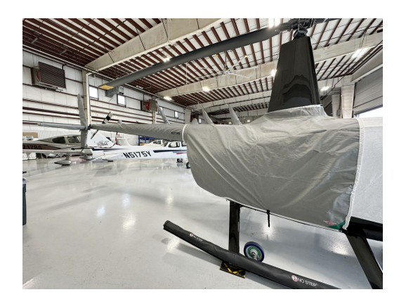
Robinson R-66 Engine Cover