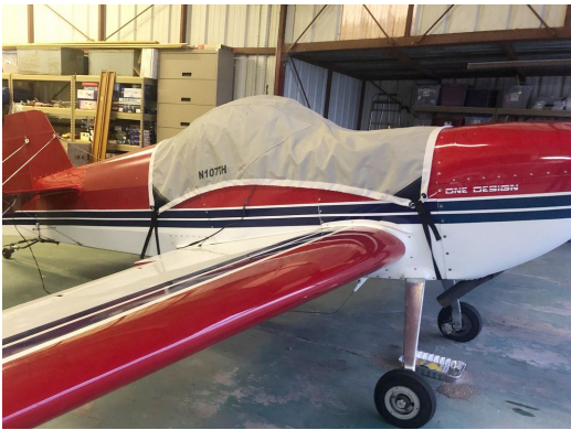
IAC One Design Travel Weight Canopy Cover

Travel Covers are made with Silver Solution-Dyed Polyester fabric and only lined over the windshield to save weight. The material is lightweight and more compact for easy stowage in the aircraft. The polyester material is water resistant, but only intended for occasional use outside. We also have an ultra lightweight material available for fitted hangar dust covers. For daily outdoor use, the non-travel Sunbrella Cover is the best choice.