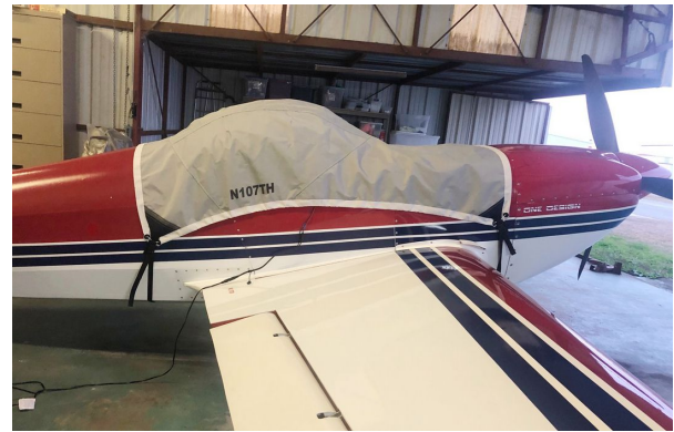
IAC One Design Travel Weight Canopy Cover