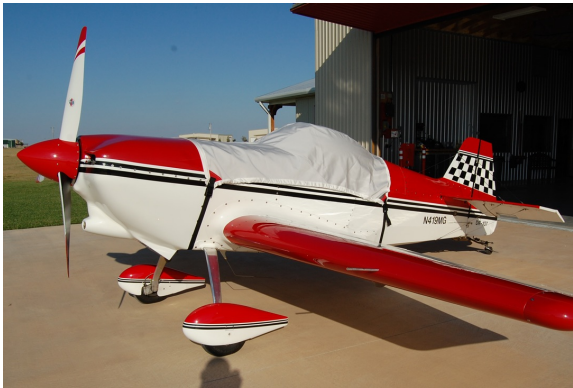
IAC One Design Canopy Cover

This cover type is made from Silver Acrylic Sunbrella canvas and is 100% lined with a soft and smooth microfiber. Bruce's Custom Covers developed this material combination especially for aircraft protection. The outer material is medium weight and treated for water resistance, UV resistance and anti-static buildup. The inner lining is a very soft and smooth microfiber to prevent scratching. The material is very reflective, and tests show that the cabin interior temperature can be reduced to near-ambient temperature on the hottest of days. It is water, ice and snow repellent, yet breathable to allow moisture to escape from between the cover and the aircraft surface.