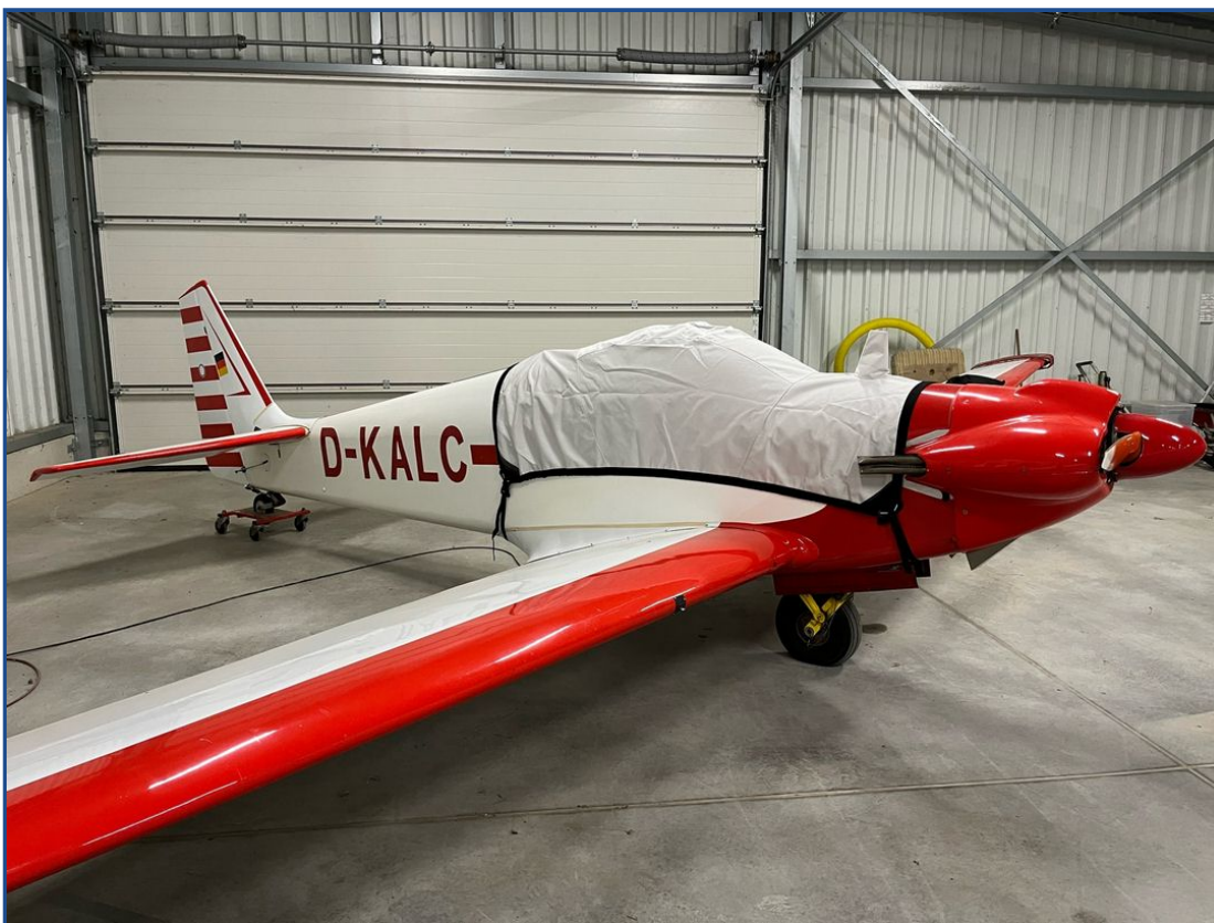
Fournier RF-4D Motorglider Canopy Cover