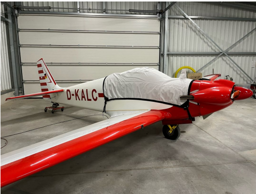
Fournier RF-4D Motorglider Canopy Cover