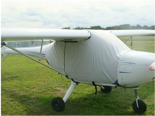
Remos G3 & GX MODELS Extended Canopy Cover (Over-The-Top Style)