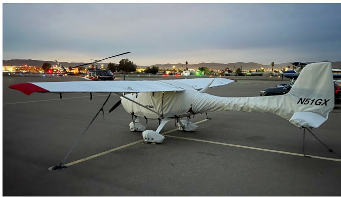
Remos RG-3 Complete Cover Set