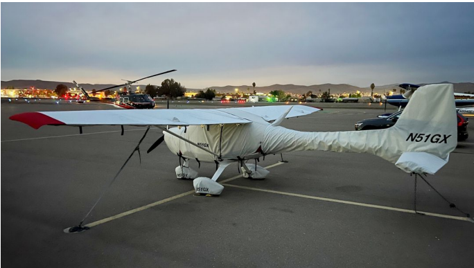
Remos RG-3 Complete Cover Set