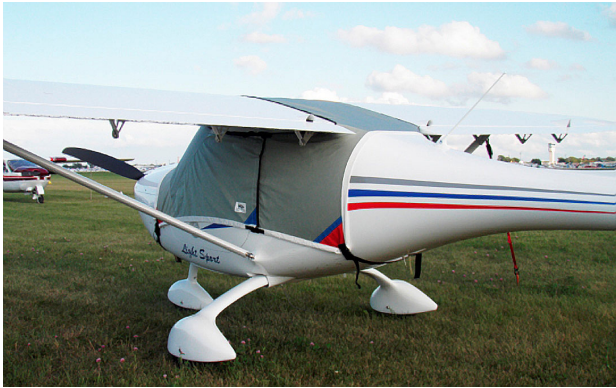
Remos G3 Travel Weight Canopy Cover

This cover type is made from Silver Acrylic Sunbrella canvas and is 100% lined with a soft and smooth microfiber. Bruce's Custom Covers developed this material combination especially for aircraft protection. The outer material is medium weight and treated for water resistance, UV resistance and anti-static buildup. The inner lining is a very soft and smooth microfiber to prevent scratching. The material is very reflective, and tests show that the cabin interior temperature can be reduced to near-ambient temperature on the hottest of days. It is water, ice and snow repellent, yet breathable to allow moisture to escape from between the cover and the aircraft surface.