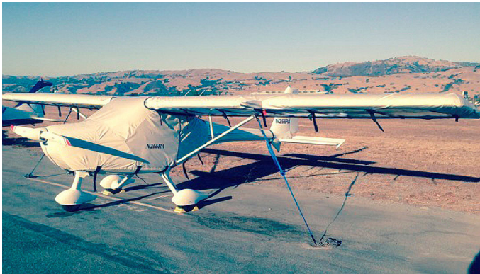
Remos Extended Canopy/Engine, Wing Covers

WINTER USE MATERIAL - Made with Solution-Dyed Polyester fabric, this option is intended for seasonal use to aid in deicing, rain mitigation, or for occasional travel. The material is lighter and more compact, but more susceptible to UV damage and may have a shorter useful life if used continuously outside than the all-year use material.