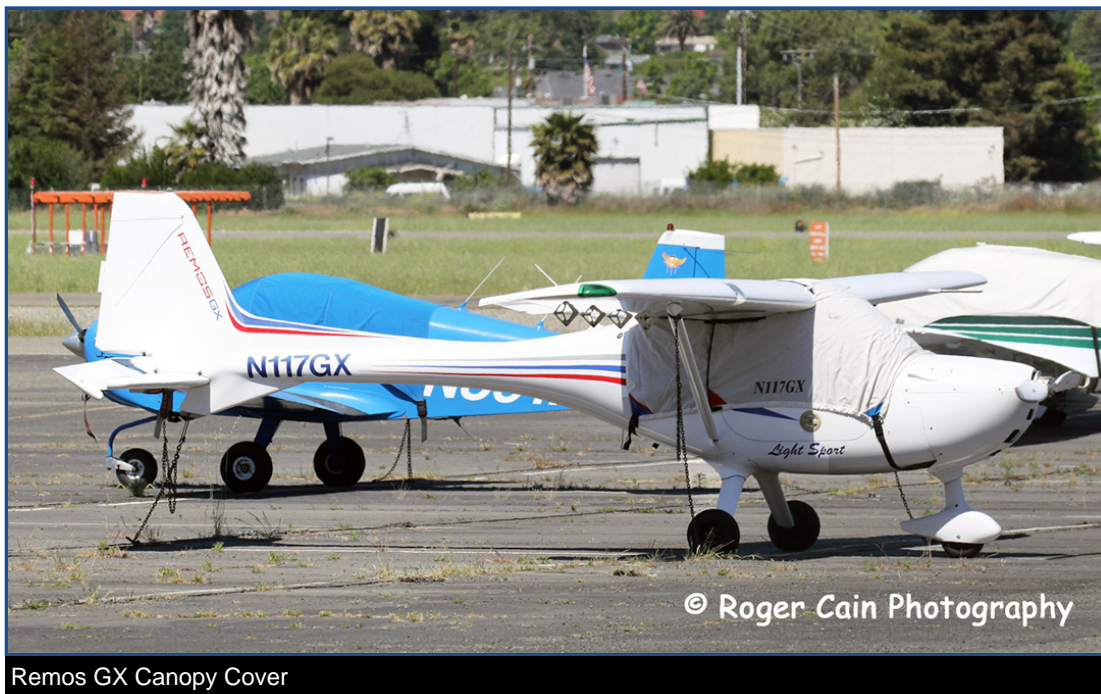
Remos GX Canopy Cover