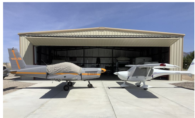
G-3/600 Travel Cover and Zlin 142 Canopy Cover