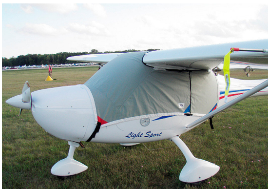
Remos G3 Travel Weight Canopy Cover

Travel Covers are made with Silver Solution-Dyed Polyester fabric and only lined over the windshield to save weight. The material is lightweight and more compact for easy stowage in the aircraft. The polyester material is water resistant, but only intended for occasional use outside. We also have an ultra lightweight material available for fitted hangar dust covers. For daily outdoor use, the non-travel Sunbrella Cover is the best choice.