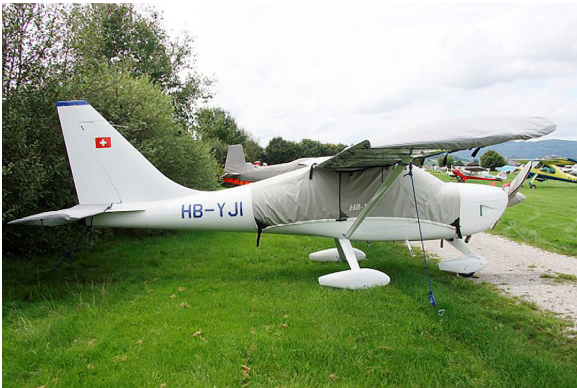
Glastar Canopy, Wings, Horizontal Stab. & Prop Covers