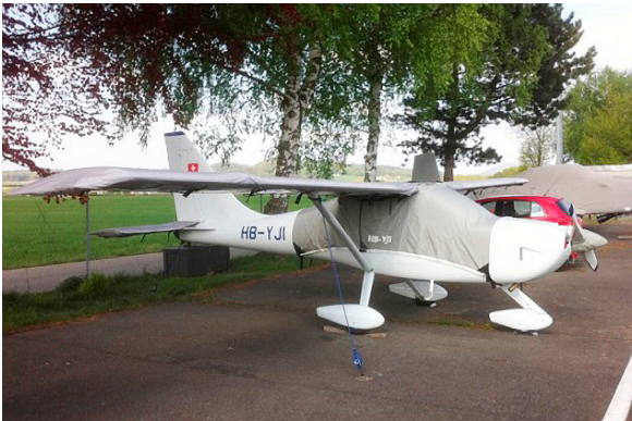
OMF Symphony Canopy, Wings, Horiz. Stab, and Prop Covers

This cover type is made from Silver Acrylic Sunbrella canvas and is 100% lined with a soft and smooth microfiber. Bruce's Custom Covers developed this material combination especially for aircraft protection. The outer material is medium weight and treated for water resistance, UV resistance and anti-static buildup. The inner lining is a very soft and smooth microfiber to prevent scratching. The material is very reflective, and tests show that the cabin interior temperature can be reduced to near-ambient temperature on the hottest of days. It is water, ice and snow repellent, yet breathable to allow moisture to escape from between the cover and the aircraft surface.