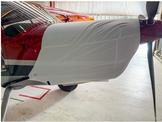
Rans S-21 Engine Cover, test fit cover