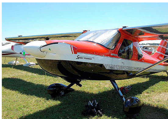
Glaster Sportsman Windshield HeatShield

Windshield Heatshields are interior sunshades for an aircraft's front windshield. The product is a unique composite of closed-cell foam with a silver mylar finish. The semi-rigid design is stiff enough to stand along the inside of the windshield using sun visors or window framing. It folds up flat and easily stores in the included storage sleeve. Some designs may require velcro and suction cups or split right and left sides. A Heatshield is an excellent short-term remedy for cockpit overheating. An external fabric cover is far more effective and practical for long-term protection.