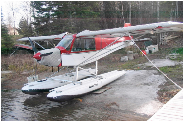
Rans S-7 Insulated Engine, Wing and Horizontal Stabilizer Covers FOR INTERIOR USE. Cub Crafters CC-11 Insulated Hangar Blanket, available in Red or Silver

This cover type is made from Silver Acrylic Sunbrella canvas and is 100% lined with a soft and smooth microfiber. Bruce's Custom Covers developed this material combination especially for aircraft protection. The outer material is medium weight and treated for water resistance, UV resistance and anti-static buildup. The inner lining is a very soft and smooth microfiber to prevent scratching. The material is very reflective, and tests show that the cabin interior temperature can be reduced to near-ambient temperature on the hottest of days. It is water, ice and snow repellent, yet breathable to allow moisture to escape from between the cover and the aircraft surface.