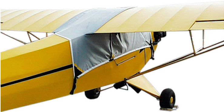
Piper J3 Over-Top Canopy Cover

This cover type is made from Silver Acrylic Sunbrella canvas and is 100% lined with a soft and smooth microfiber. Bruce's Custom Covers developed this material combination especially for aircraft protection. The outer material is medium weight and treated for water resistance, UV resistance and anti-static buildup. The inner lining is a very soft and smooth microfiber to prevent scratching. The material is very reflective, and tests show that the cabin interior temperature can be reduced to near-ambient temperature on the hottest of days. It is water, ice and snow repellent, yet breathable to allow moisture to escape from between the cover and the aircraft surface.