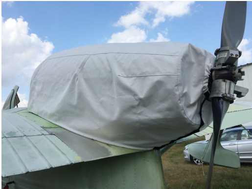
Republic Seabee Engine Cover

water resistance, UV resistance and anti-static buildup. The inner lining is a very soft and smooth microfiber to prevent scratching. The material is very reflective, and tests show that the cabin interior temperature can be reduced to near-ambient temperature on the hottest of days. It is water, ice and snow repellent, yet breathable to allow moisture to escape from between the cover and the aircraft surface.