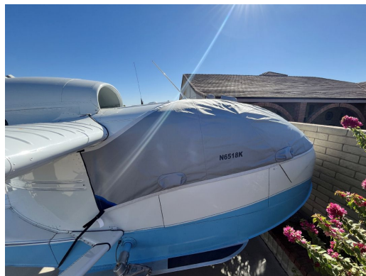
Seabee Amphibian Travel Cover, Light Weight Canopy Cover