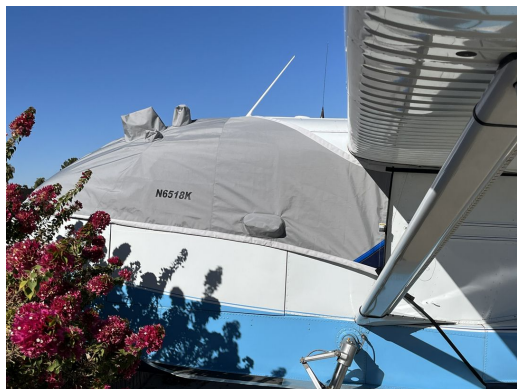
Seabee Amphibian Travel Cover, Light Weight Canopy Cover

This cover type is made from Silver Acrylic Sunbrella canvas and is 100% lined with a soft and smooth microfiber. Bruce's Custom Covers developed this material combination especially for aircraft protection. The outer material is medium weight and treated for water resistance, UV resistance and anti-static buildup. The inner lining is a very soft and smooth microfiber to prevent scratching. The material is very reflective, and tests show that the cabin interior temperature can be reduced to near-ambient temperature on the hottest of days. It is water, ice and snow repellent, yet breathable to allow moisture to escape from between the cover and the aircraft surface.