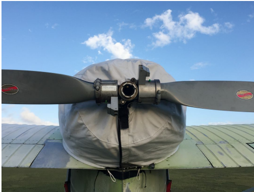
Republic Seabee Engine Cover