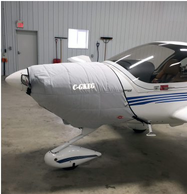
Diamond DA-20-C1 Insulated Engine Cover

This cover type is made from Silver Acrylic Sunbrella canvas and is 100% lined with a soft and smooth microfiber. Bruce's Custom Covers developed this material combination especially for aircraft protection. The outer material is medium weight and treated for water resistance, UV resistance and anti-static buildup. The inner lining is a very soft and smooth microfiber to prevent scratching. The material is very reflective, and tests show that the cabin interior temperature can be reduced to near-ambient temperature on the hottest of days. It is water, ice and snow repellent, yet breathable to allow moisture to escape from between the cover and the aircraft surface.