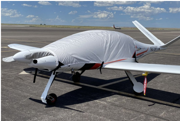
Swiss Excellence Risen 914 Canopy Cover