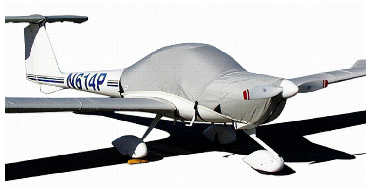
Diamond DA-20 Canopy/Engine, Wing & Horiz. Stab. Covers