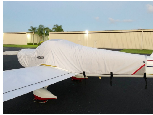
Van's RV-12 Extended Canopy/Engine Cover (special: extends to tail)