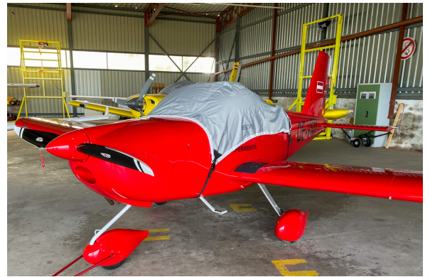
Van's RV-12 Travel Weight Canopy Cover