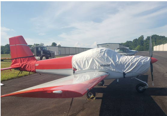
Van's RV-12 Canopy/Engine Cover, Tailcone Cover (raincap type)