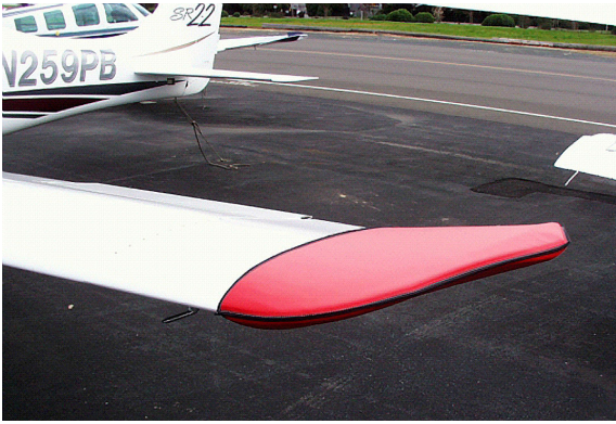
Cirrus SR-22 Wingtip Pad (also available for the Horiz. Stab.