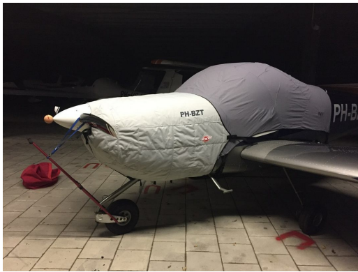
RV-12 Travel Cover, Light Weight Canopy Cover, w/18" forward extension

Travel Covers are made with Silver Solution-Dyed Polyester fabric and only lined over the windshield to save weight. The material is lightweight and more compact for easy stowage in the aircraft. The polyester material is water resistant, but only intended for occasional use outside. We also have an ultra lightweight material available for fitted hangar dust covers. For daily outdoor use, the non-travel Sunbrella Cover is the best choice.