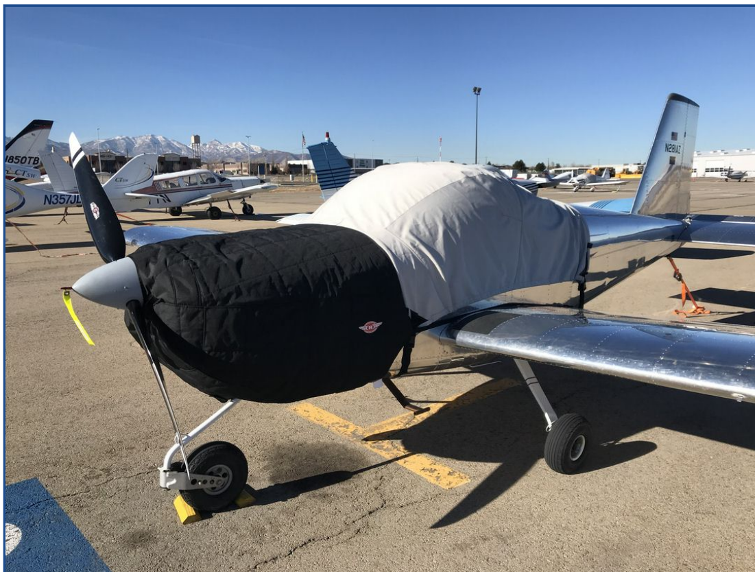
Van's RV-12 Canopy Cover, Insulated Engine Cover