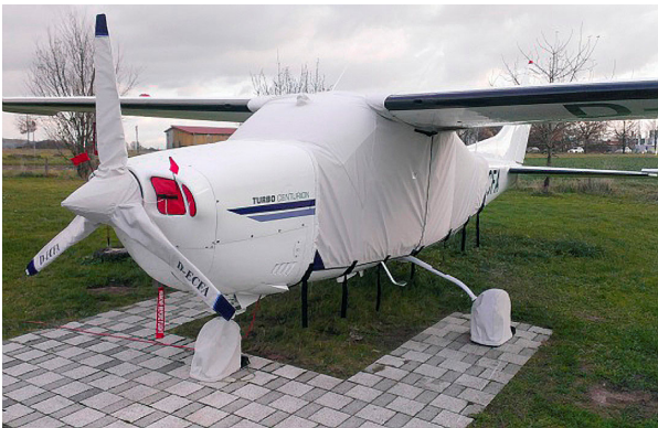
Cessna 210 Extended Canopy Cover, Engine Plugs, Prop and Tire Covers

ALL-YEAR USE MATERIAL - Made with Silver Acrylic Sunbrella canvas, the all-year use material is the best option for sun protection and cover longevity. This heavier more durable material is intended for all weather conditions, such as rain and snow or lots of sun.