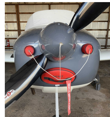
Vans RV-12 Engine Plugs