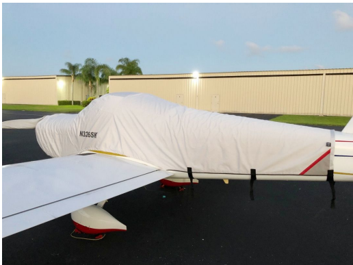
Van's RV-12 Extended Canopy/Engine Cover (special: extends to tail)

This cover type is made from Silver Acrylic Sunbrella canvas and is 100% lined with a soft and smooth microfiber. Bruce's Custom Covers developed this material combination especially for aircraft protection. The outer material is medium weight and treated for water resistance, UV resistance and anti-static buildup. The inner lining is a very soft and smooth microfiber to prevent scratching. The material is very reflective, and tests show that the cabin interior temperature can be reduced to near-ambient temperature on the hottest of days. It is water, ice and snow repellent, yet breathable to allow moisture to escape from between the cover and the aircraft surface.