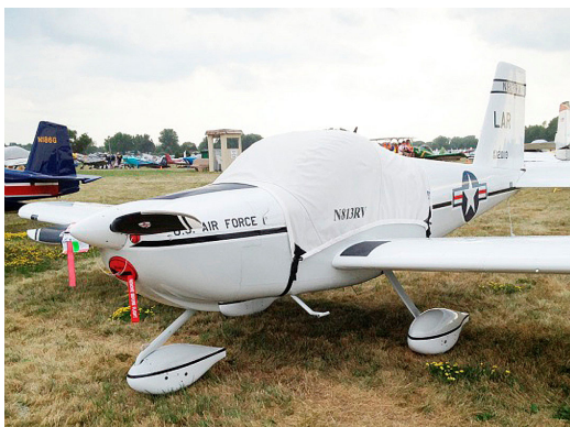
Vans's RV-12 Canopy Cover & Engine Plugs

Engine Inlet Plugs are custom fit for your Van's Aircraft RV-12 & RV-12is intakes, made with heavy-duty vinyl material, and stuffed with a single block of sculpted urethane foam. Each plug has a zipper that allows the foam to be removed and dried if necessary. Engine plugs have warning flags that are visible from the cockpit or 'remove before flight' streamers sewn onto the face of the plugs. Most plugs are imprinted with the aircraft registration number in black for an extra charge. Storage bag NOT included. Engine plugs may be inserted after flight when the engine is still warm. Engine Inlet Plugs are commonly referred to as Cowl Plugs, Intake Plugs, Cowl Blocks, Engine Blocks, and Engine Bunges.