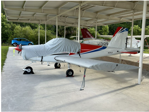
Van's RV-12 Canopy/Engine & Wing Covers

WINTER USE MATERIAL - Made with Solution-Dyed Polyester fabric, this option is intended for seasonal use to aid in deicing, rain mitigation, or for occasional travel. The material is lighter and more compact, but more susceptible to UV damage and may have a shorter useful life if used continuously outside than the all-year use material.