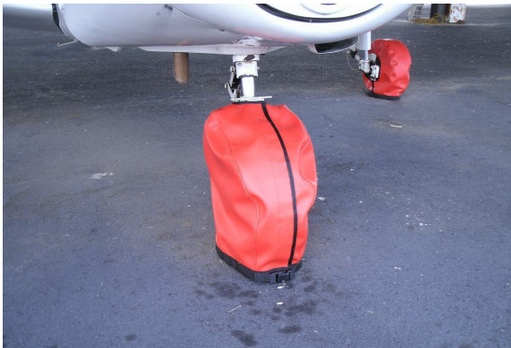
Piper PA28-140 Tire Covers