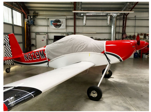
Van's RV-14 Travel Canopy Cover