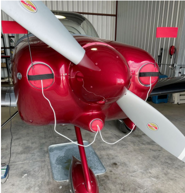
RV-14A Engine Inlet Plugs, Sam James Cowl

Engine Inlet Plugs are custom fit for your Van's Aircraft RV-14 intakes, made with heavy-duty vinyl material, and stuffed with a single block of sculpted urethane foam. Each plug has a zipper that allows the foam to be removed and dried if necessary. Engine plugs have warning flags that are visible from the cockpit or 'remove before flight' streamers sewn onto the face of the plugs. Most plugs are imprinted with the aircraft registration number in black for an extra charge. Storage bag NOT included. Engine plugs may be inserted after flight when the engine is still warm. Engine Inlet Plugs are commonly referred to as Cowl Plugs, Intake Plugs, Cowl Blocks, Engine Blocks, and Engine Bunges.