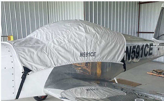
RV-14 Canopy Cover

This cover type is made from Silver Acrylic Sunbrella canvas and is 100% lined with a soft and smooth microfiber. Bruce's Custom Covers developed this material combination especially for aircraft protection. The outer material is medium weight and treated for water resistance, UV resistance and anti-static buildup. The inner lining is a very soft and smooth microfiber to prevent scratching. The material is very reflective, and tests show that the cabin interior temperature can be reduced to near-ambient temperature on the hottest of days. It is water, ice and snow repellent, yet breathable to allow moisture to escape from between the cover and the aircraft surface.