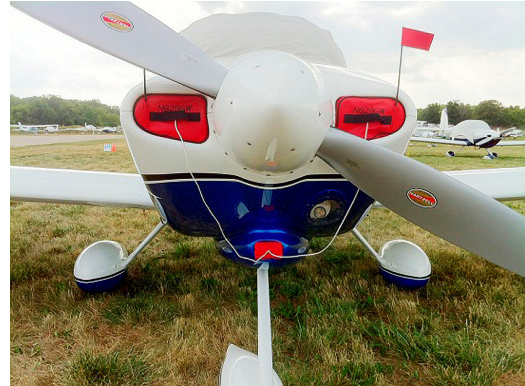
Van's RV-10 Canopy Cover & Engine Inlet Plugs