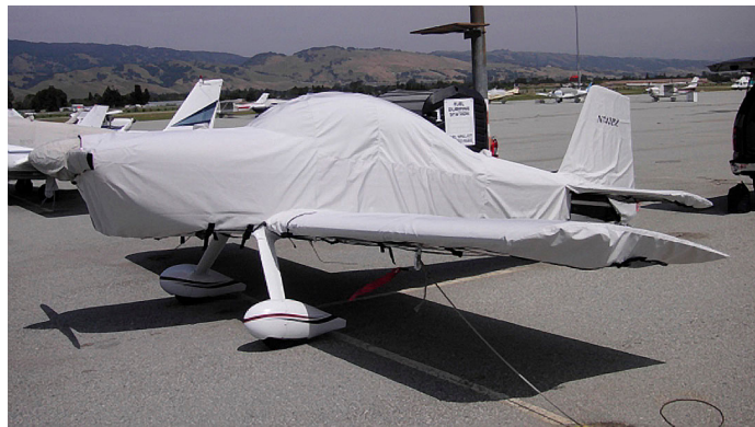
Van's RV-8 Complete Fuselage Cover w/ Detachable Wing Covers & Prop Cover