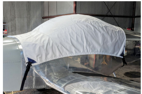
Van's RV-14A Canopy Cover