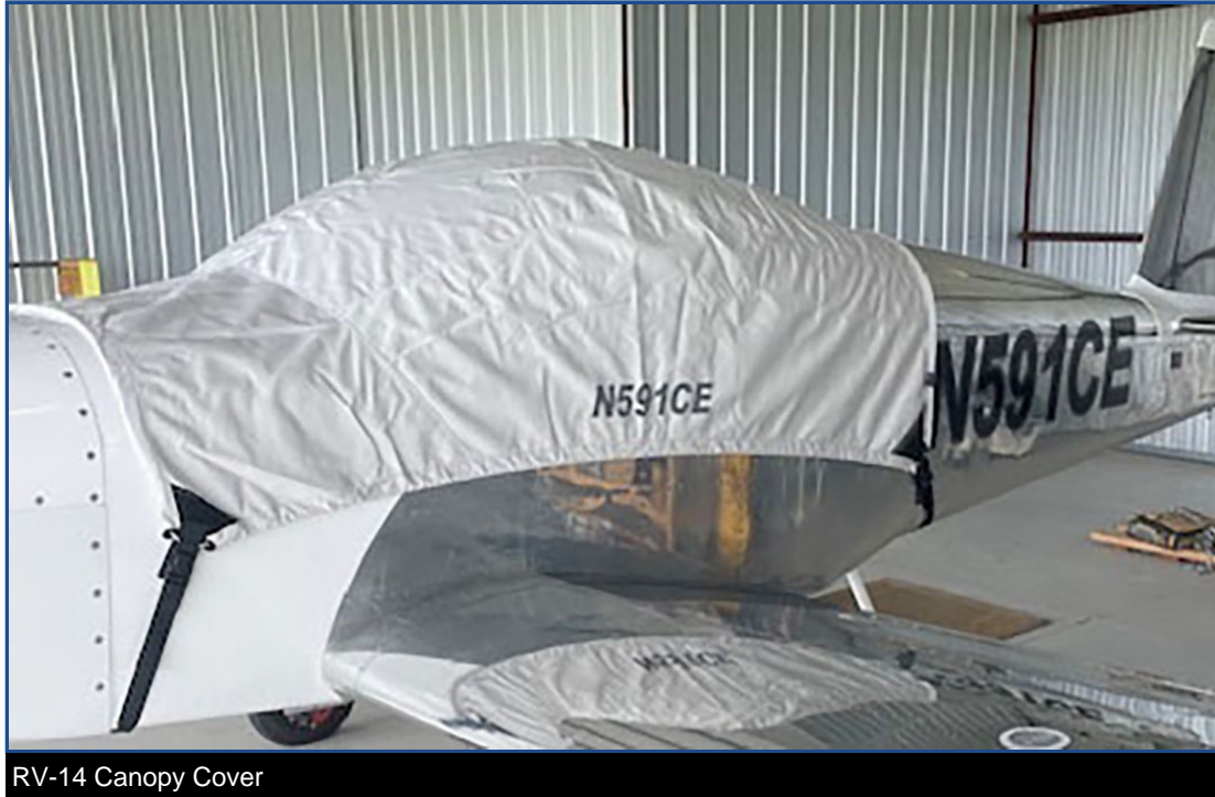
RV-14 Canopy Cover