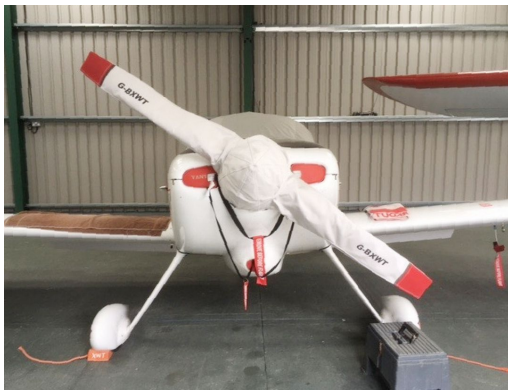
Van's RV-6 Prop/Spinner Cover

This cover type is made from Silver Acrylic Sunbrella canvas and is 100% lined with a soft and smooth microfiber. Bruce's Custom Covers developed this material combination especially for aircraft protection. The outer material is medium weight and treated for water resistance, UV resistance and anti-static buildup. The inner lining is a very soft and smooth microfiber to prevent scratching. The material is very reflective, and tests show that the cabin interior temperature can be reduced to near-ambient temperature on the hottest of days. It is water, ice and snow repellent, yet breathable to allow moisture to escape from between the cover and the aircraft surface.