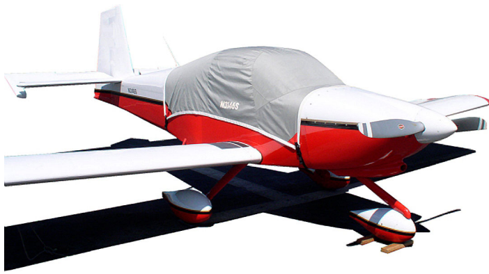
Van's RV-10 Canopy Cover