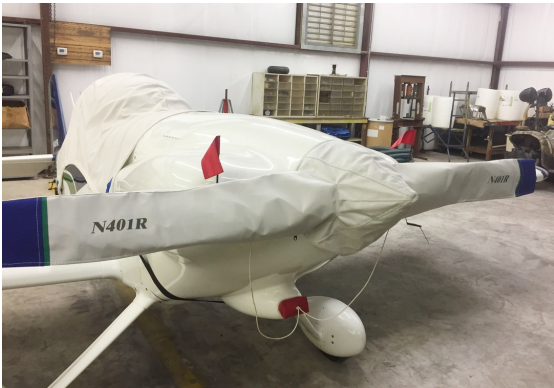
Van's Aircraft RV-4 Propellor/Spinner Cover, 2 Blade