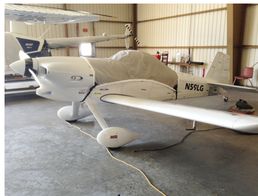
Van's RV-3 Light Weight Travel Cover