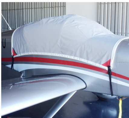
Vans's RV-9 Light Weight Travel Canopy Cover

Travel Covers are made with Silver Solution-Dyed Polyester fabric and only lined over the windshield to save weight. The material is lightweight and more compact for easy stowage in the aircraft. The polyester material is water resistant, but only intended for occasional use outside. We also have an ultra lightweight material available for fitted hangar dust covers. For daily outdoor use, the non-travel Sunbrella Cover is the best choice.