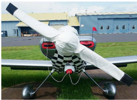
Van's RV-3 Engine Plugs, Prop/Spinner Cover