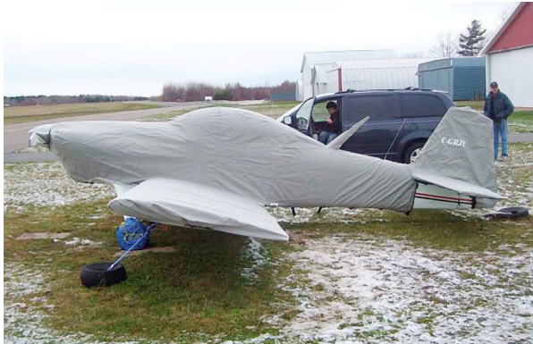
Van's RV-4 Complete Fuselage/Wing/Tail Surfaces cover

This cover type is made from Silver Acrylic Sunbrella canvas and is 100% lined with a soft and smooth microfiber. Bruce's Custom Covers developed this material combination especially for aircraft protection. The outer material is medium weight and treated for water resistance, UV resistance and anti-static buildup. The inner lining is a very soft and smooth microfiber to prevent scratching. The material is very reflective, and tests show that the cabin interior temperature can be reduced to near-ambient temperature on the hottest of days. It is water, ice and snow repellent, yet breathable to allow moisture to escape from between the cover and the aircraft surface.