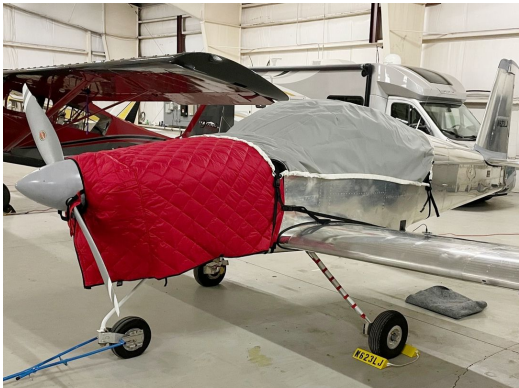
Vans RV-7 Travel Canopy Cover, Hangar Blanket

This cover type is made from Silver Acrylic Sunbrella canvas and is 100% lined with a soft and smooth microfiber. Bruce's Custom Covers developed this material combination especially for aircraft protection. The outer material is medium weight and treated for water resistance, UV resistance and anti-static buildup. The inner lining is a very soft and smooth microfiber to prevent scratching. The material is very reflective, and tests show that the cabin interior temperature can be reduced to near-ambient temperature on the hottest of days. It is water, ice and snow repellent, yet breathable to allow moisture to escape from between the cover and the aircraft surface.