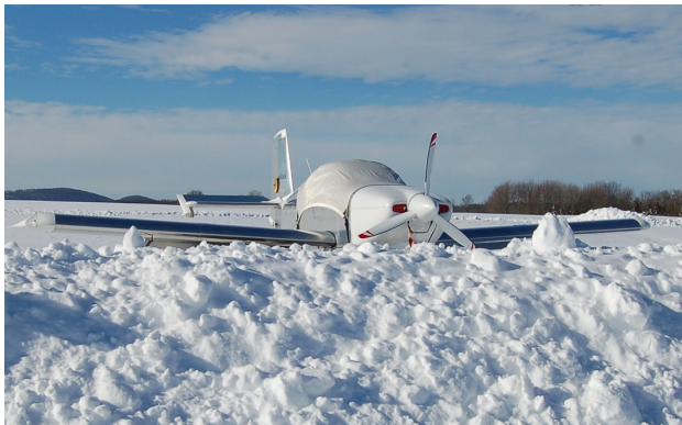
Van's RV-6 Canopy Cover

This cover type is made from Silver Acrylic Sunbrella canvas and is 100% lined with a soft and smooth microfiber. Bruce's Custom Covers developed this material combination especially for aircraft protection. The outer material is medium weight and treated for water resistance, UV resistance and anti-static buildup. The inner lining is a very soft and smooth microfiber to prevent scratching. The material is very reflective, and tests show that the cabin interior temperature can be reduced to near-ambient temperature on the hottest of days. It is water, ice and snow repellent, yet breathable to allow moisture to escape from between the cover and the aircraft surface.