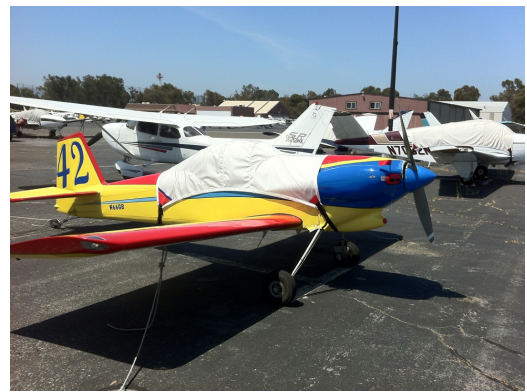
Vans's RV-3 Canopy Cover, Engine Plugs