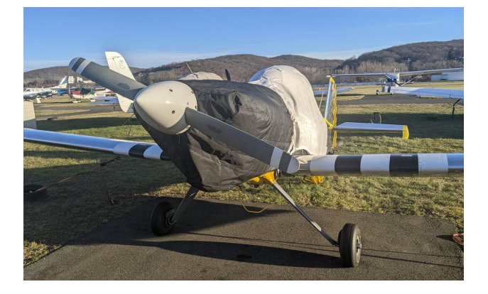
Van's RV-4 Insulated Engine Cover

This cover type is made from Silver Acrylic Sunbrella canvas and is 100% lined with a soft and smooth microfiber. Bruce's Custom Covers developed this material combination especially for aircraft protection. The outer material is medium weight and treated for water resistance, UV resistance and anti-static buildup. The inner lining is a very soft and smooth microfiber to prevent scratching. The material is very reflective, and tests show that the cabin interior temperature can be reduced to near-ambient temperature on the hottest of days. It is water, ice and snow repellent, yet breathable to allow moisture to escape from between the cover and the aircraft surface.