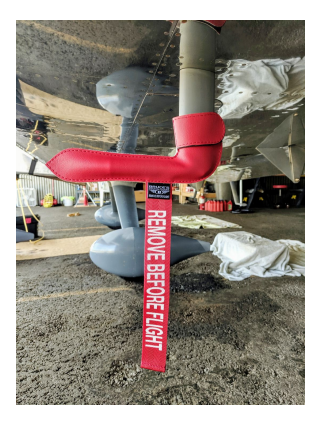
Van's RV-14 Pitot Cover

Engine Inlet Plugs are custom fit for your Van's Aircraft RV-4 intakes, made with heavy-duty vinyl material, and stuffed with a single block of sculpted urethane foam. Each plug has a zipper that allows the foam to be removed and dried if necessary. Engine plugs have warning flags that are visible from the cockpit or 'remove before flight' streamers sewn onto the face of the plugs. Most plugs are imprinted with the aircraft registration number in black for an extra charge. Storage bag NOT included. Engine plugs may be inserted after flight when the engine is still warm. Engine Inlet Plugs are commonly referred to as Cowl Plugs, Intake Plugs, Cowl Blocks, Engine Blocks, and Engine Bungs.