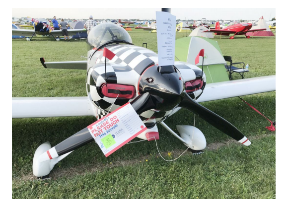
Van's RV-4 Engine Plugs