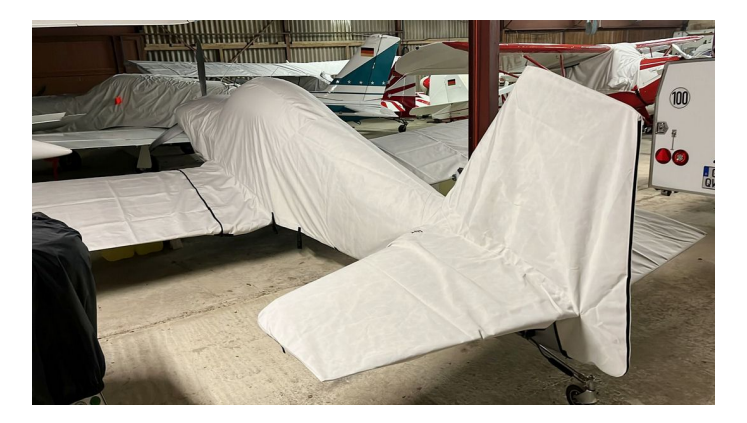
Van's Aircraft RV-4 Complete Fuselage Cover W/Detachable Wing Covers

This cover type is made from Silver Acrylic Sunbrella canvas and is 100% lined with a soft and smooth microfiber. Bruce's Custom Covers developed this material combination especially for aircraft protection. The outer material is medium weight and treated for water resistance, UV resistance and anti-static buildup. The inner lining is a very soft and smooth microfiber to prevent scratching. The material is very reflective, and tests show that the cabin interior temperature can be reduced to near-ambient temperature on the hottest of days. It is water, ice and snow repellent, yet breathable to allow moisture to escape from between the cover and the aircraft surface.