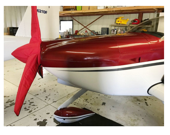
Van's RV-9 Insulated Prop Cover, 3-blade