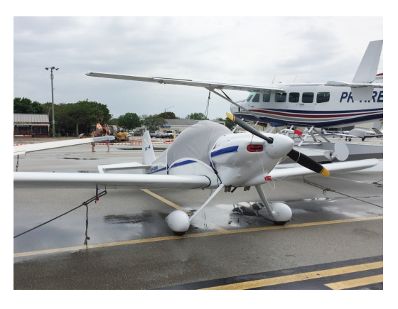
Van's RV-4/Harmon Rocket Travel Cover