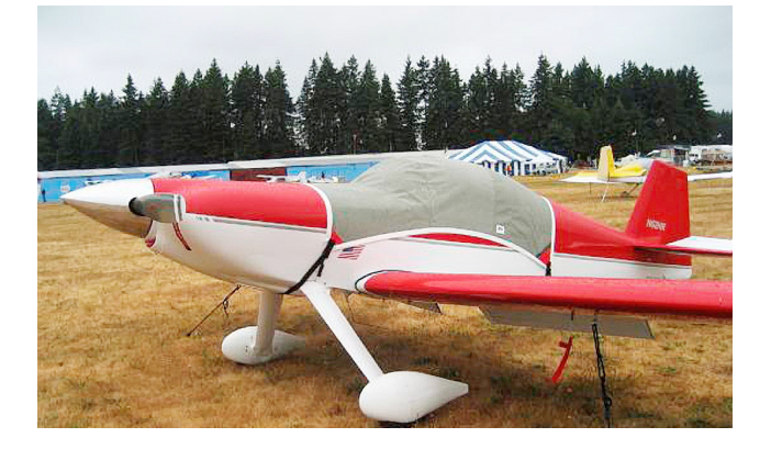
Harmon Rocket Canopy Cover & Engine Inlet Plugs

Travel Covers are made with Silver Solution-Dyed Polyester fabric and only lined over the windshield to save weight. The material is lightweight and more compact for easy stowage in the aircraft. The polyester material is water resistant, but only intended for occasional use outside. We also have an ultra lightweight material available for fitted hangar dust covers. For daily outdoor use, the non-travel Sunbrella Cover is the best choice.