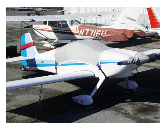
Vans's RV-6 Canopy Cover, Prop Cover