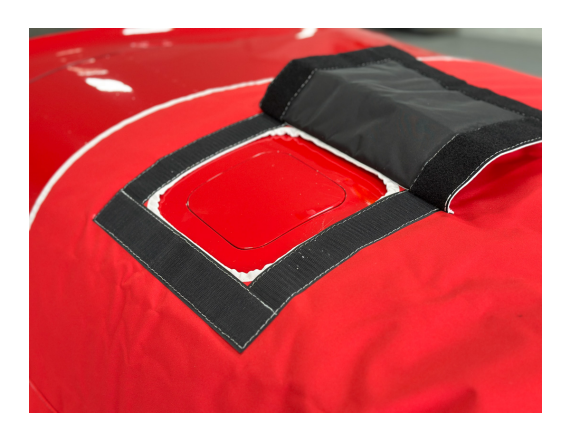
Van's RV-9A Insulated Engine Cover with oil door access