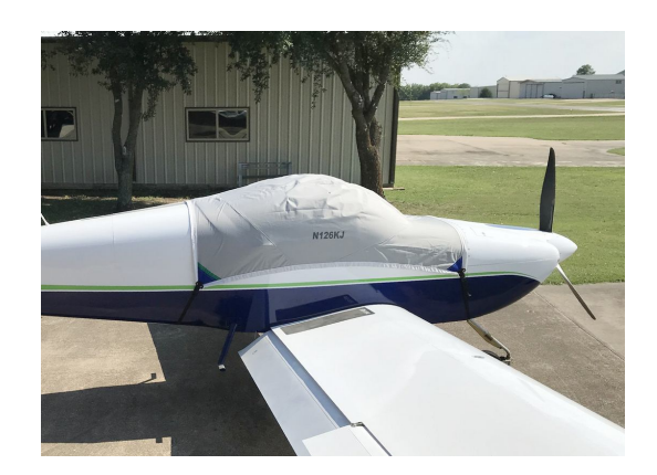
Van's RV-9A Travel Weight Canopy Cover

Travel Covers are made with Silver Solution-Dyed Polyester fabric and only lined over the windshield to save weight. The material is lightweight and more compact for easy stowage in the aircraft. The polyester material is water resistant, but only intended for occasional use outside. We also have an ultra lightweight material available for fitted hangar dust covers. For daily outdoor use, the non-travel Sunbrella Cover is the best choice.