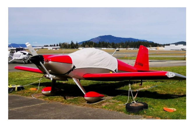
Van's RV-7 Canopy Cover