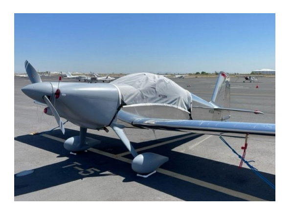
RV-7 Travel Cover, Travel Weight Canopy Cover