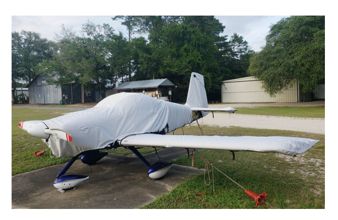
Van's RV-7A Cover Set