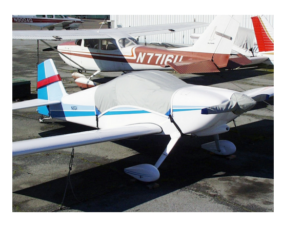
Vans's RV-6 Canopy Cover, Prop Cover