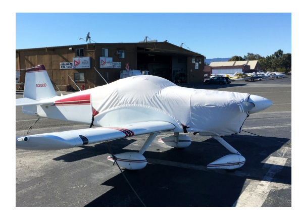
Van's RV-6A Canopy/Engine Cover

This cover type is made from Silver Acrylic Sunbrella canvas and is 100% lined with a soft and smooth microfiber. Bruce's Custom Covers developed this material combination especially for aircraft protection. The outer material is medium weight and treated for water resistance, UV resistance and anti-static buildup. The inner lining is a very soft and smooth microfiber to prevent scratching. The material is very reflective, and tests show that the cabin interior temperature can be reduced to near-ambient temperature on the hottest of days. It is water, ice and snow repellent, yet breathable to allow moisture to escape from between the cover and the aircraft surface.