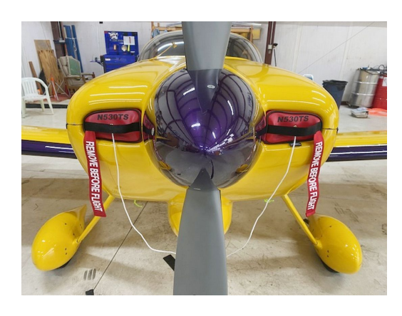
Van's Aircraft RV-7 Engine Inlet Plugs