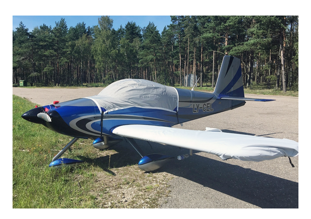
Van's RV-7/7A Travel and Wing Covers

WINTER USE MATERIAL - Made with Solution-Dyed Polyester fabric, this option is intended for seasonal use to aid in deicing, rain mitigation, or for occasional travel. The material is lighter and more compact, but more susceptible to UV damage and may have a shorter useful life if used continuously outside than the all-year use material.