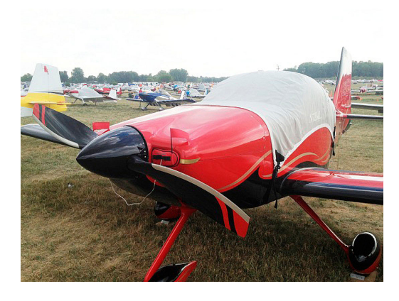
Van's RV-7 Canopy Cover & Engine Inlet Plugs