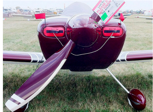
Van's RV-8 Engine Inlet Plugs