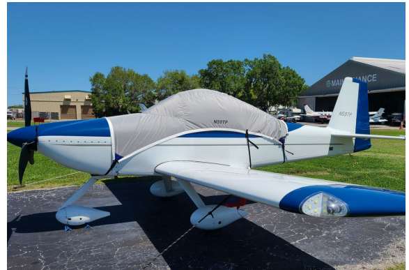
Van's RV-8 Complete Fuselage Cover with Detachable Wing Covers Van's RV-8 Canopy Cover, 3RD BELLY STRAP OPTIONAL