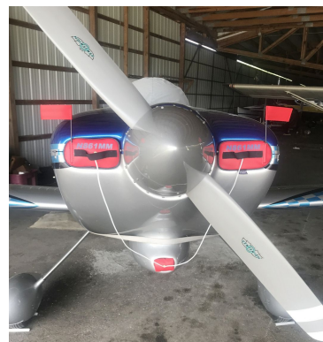
Van's RV-8 Engine Plugs