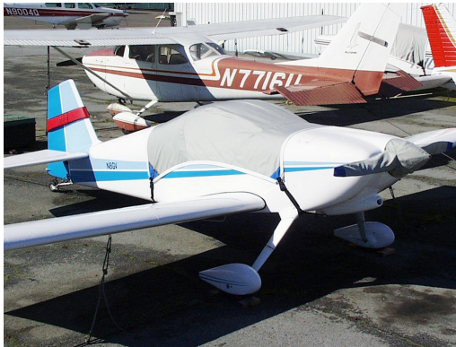
Van's RV-6 Canopy Cover, Prop Cover

This cover type is made from Silver Acrylic Sunbrella canvas and is 100% lined with a soft and smooth microfiber. Bruce's Custom Covers developed this material combination especially for aircraft protection. The outer material is medium weight and treated for water resistance, UV resistance and anti-static buildup. The inner lining is a very soft and smooth microfiber to prevent scratching. The material is very reflective, and tests show that the cabin interior temperature can be reduced to near-ambient temperature on the hottest of days. It is water, ice and snow repellent, yet breathable to allow moisture to escape from between the cover and the aircraft surface.