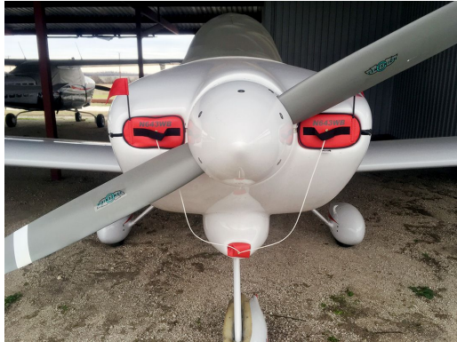
Van's RV-8A Engine Inlet Covers

Engine Inlet Plugs are custom fit for your Van's Aircraft RV-8/8A intakes, made with heavy-duty vinyl material, and stuffed with a single block of sculpted urethane foam. Each plug has a zipper that allows the foam to be removed and dried if necessary. Engine plugs have warning flags that are visible from the cockpit or 'remove before flight' streamers sewn onto the face of the plugs. Most plugs are imprinted with the aircraft registration number in black for an extra charge. Storage bag NOT included. Engine plugs may be inserted after flight when the engine is still warm. Engine Inlet Plugs are commonly referred to as Cowl Plugs, Intake Plugs, Cowl Blocks, Engine Blocks, and Engine Bungs.