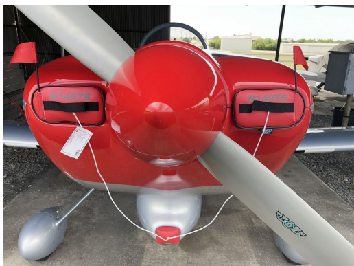
Van's RV-8 Engine Plugs, set of 3

Engine Inlet Plugs are custom fit for your Van's Aircraft RV-8/8A intakes, made with heavy-duty vinyl material, and stuffed with a single block of sculpted urethane foam. Each plug has a zipper that allows the foam to be removed and dried if necessary. Engine plugs have warning flags that are visible from the cockpit or 'remove before flight' streamers sewn onto the face of the plugs. Most plugs are imprinted with the aircraft registration number in black for an extra charge. Storage bag NOT included. Engine plugs may be inserted after flight when the engine is still warm. Engine Inlet Plugs are commonly referred to as Cowl Plugs, Intake Plugs, Cowl Blocks, Engine Blocks, and Engine Bungs.