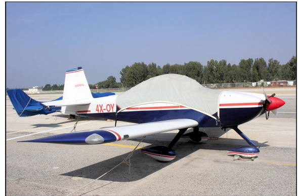
Van's RV-8 Canopy Cover