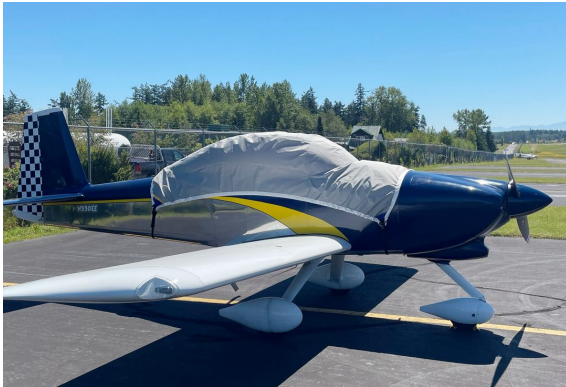
RV-8A Travel Canopy Cover

Travel Covers are made with Silver Solution-Dyed Polyester fabric and only lined over the windshield to save weight. The material is lightweight and more compact for easy stowage in the aircraft. The polyester material is water resistant, but only intended for occasional use outside. We also have an ultra lightweight material available for fitted hangar dust covers. For daily outdoor use, the non-travel Sunbrella Cover is the best choice.