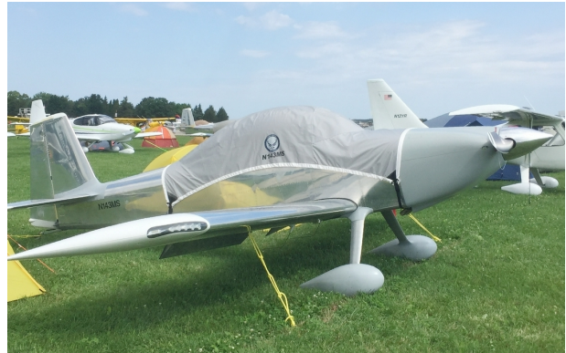
Van's Aircraft RV-8 Travel Cover, Light Weight Travel Canopy Cover