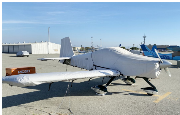
Van's RV-9A Extended Canopy/Engine, Wing & Empennage Covers