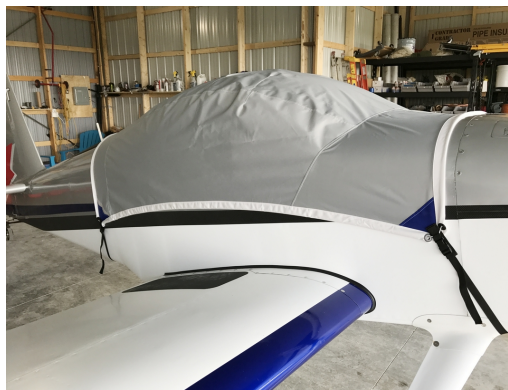
Van's Aircraft RV-9 Travel Cover, Light Weight Travel Canopy Cover