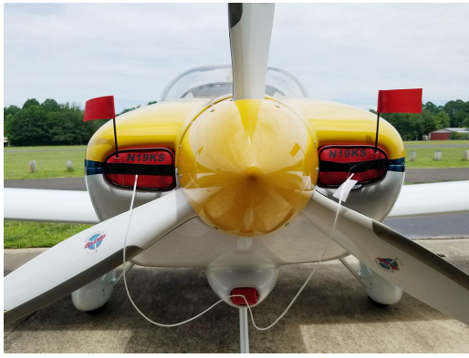
Van's RV-9A Engine Inlet Plugs