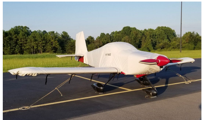
Van's RV-7A Complete Cover Set