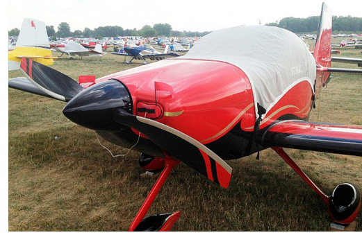
Van's RV-7 Canopy Cover & Engine Inlet Plugs