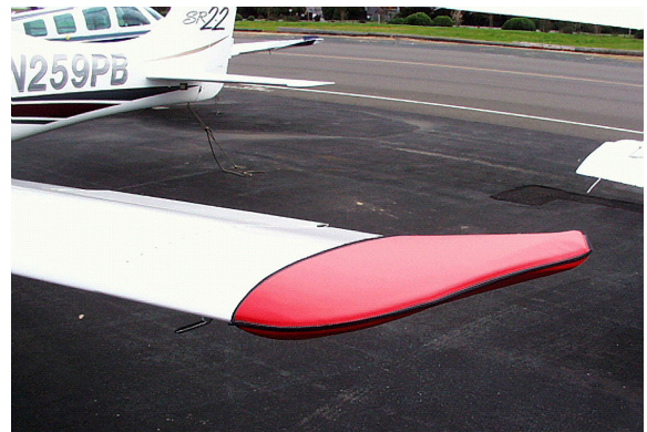
Cirrus SR-22 Wingtip Pad (also available for the Horiz. Stab.)