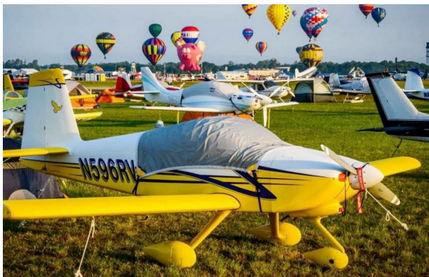
Vans's RV-9 Travel Weight Canopy Cover at Sun 'n Fun

lightweight and more compact for easy stowage in the aircraft. The polyester material is water resistant, but only intended for occasional use outside. We also have an ultra lightweight material available for fitted hangar dust covers. For daily outdoor use, the non-travel Sunbrella Cover is the best choice.