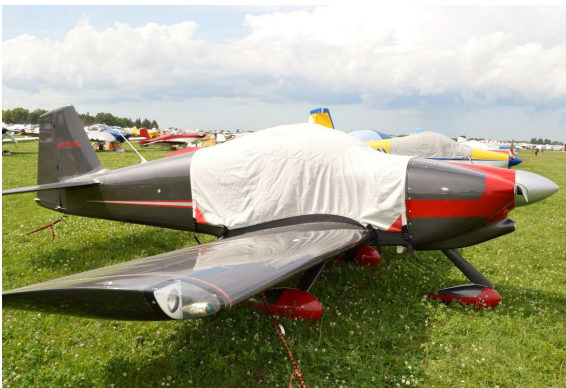
Van's RV-7A Extended Canopy Cover

This cover type is made from Silver Acrylic Sunbrella canvas and is 100% lined with a soft and smooth microfiber. Bruce's Custom Covers developed this material combination especially for aircraft protection. The outer material is medium weight and treated for water resistance, UV resistance and anti-static buildup. The inner lining is a very soft and smooth microfiber to prevent scratching. The material is very reflective, and tests show that the cabin interior temperature can be reduced to near-ambient temperature on the hottest of days. It is water, ice and snow repellent, yet breathable to allow moisture to escape from between the cover and the aircraft surface.