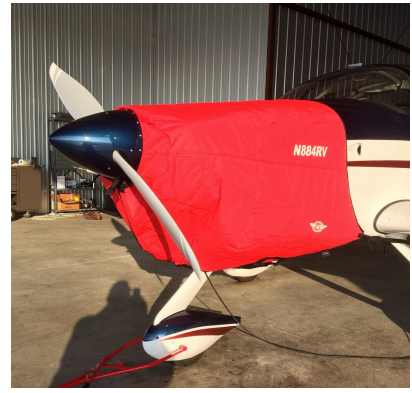
Van's RV-9A Insulated Engine Cover