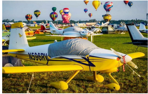
Vans's RV-9 Travel Weight Canopy Cover at Sun 'n Fun