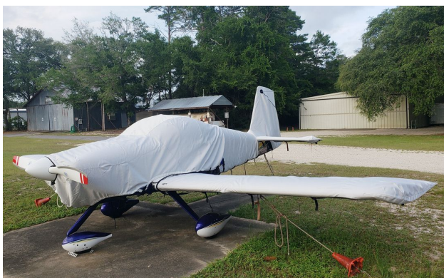
Van's RV-7A Cover Set

WINTER USE MATERIAL - Made with Solution-Dyed Polyester fabric, this option is intended for seasonal use to aid in deicing, rain mitigation, or for occasional travel. The material is lighter and more compact, but more susceptible to UV damage and may have a shorter useful life if used continuously outside than the all-year use material.