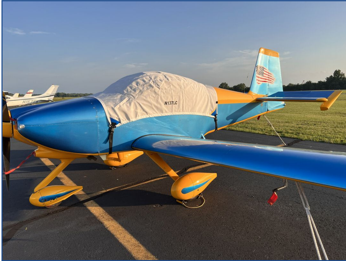
Van's RV9A Canopy Cover