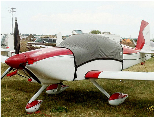
Van's RV-9 Travel Canopy Cover

occasional use outside. We also have an ultra lightweight material available for fitted hangar dust covers. For daily outdoor use, the non-travel Sunbrella Cover is the best choice.