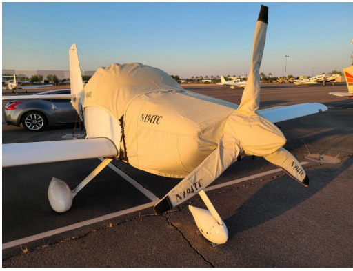
Van's RV-9 Canopy, Engine & Prop Covers