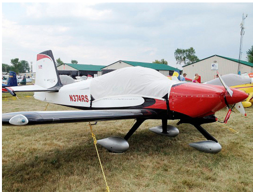
Van's RV-9 Canopy Cover

This cover type is made from Silver Acrylic Sunbrella canvas and is 100% lined with a soft and smooth microfiber. Bruce's Custom Covers developed this material combination especially for aircraft protection. The outer material is medium weight and treated for water resistance, UV resistance and anti-static buildup. The inner lining is a very soft and smooth microfiber to prevent scratching. The material is very reflective, and tests show that the cabin interior temperature can be reduced to near-ambient temperature on the hottest of days. It is water, ice and snow repellent, yet breathable to allow moisture to escape from between the cover and the aircraft surface.