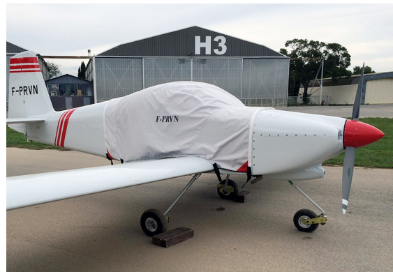
Van's Aircraft RV-9/9A Extended Canopy Cover